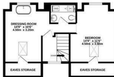
1ST FLOOR 703 sq.ft. (65.3 sq.m.) approx.