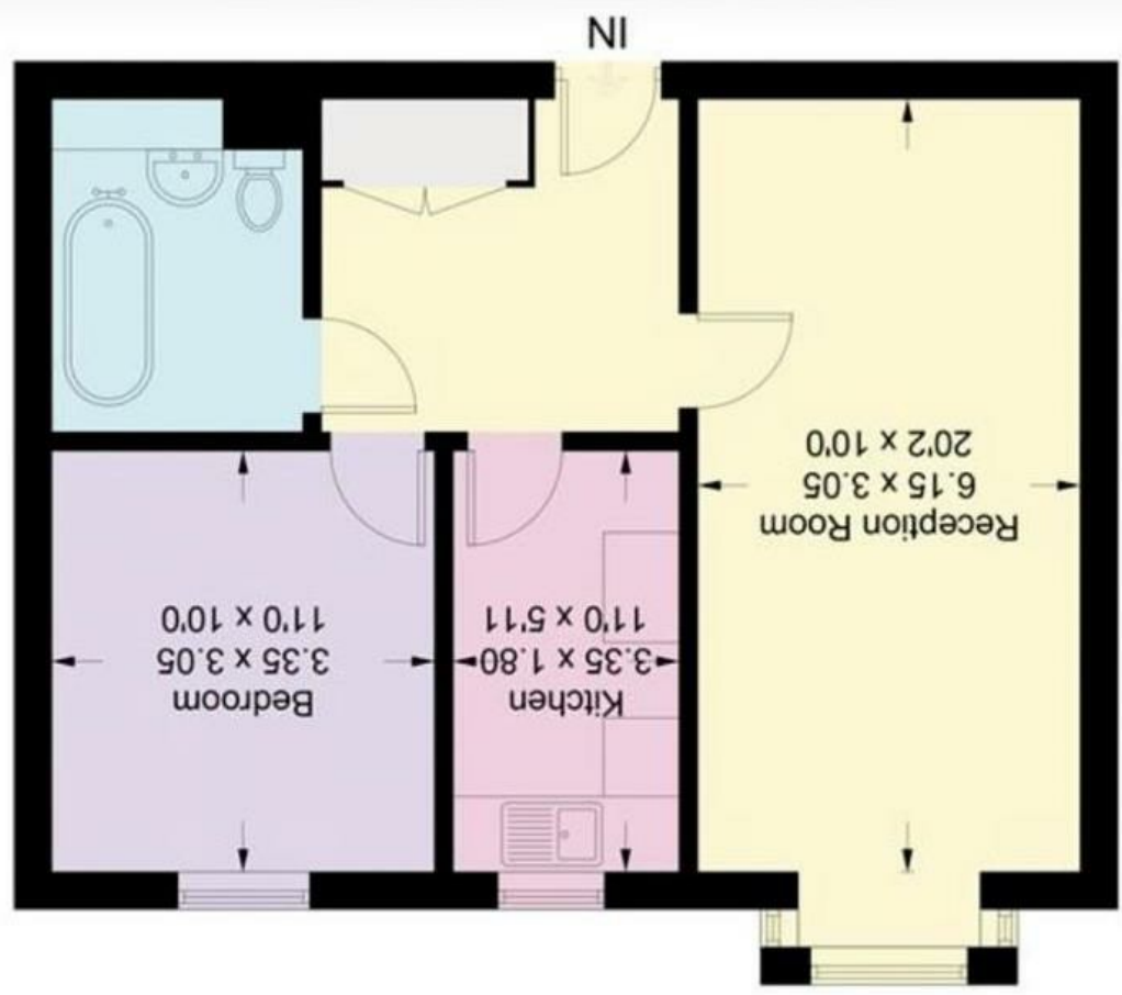
Approximate Gross Internal Area = 51.4 sq m / 553 sq ft 9 Highwood Court