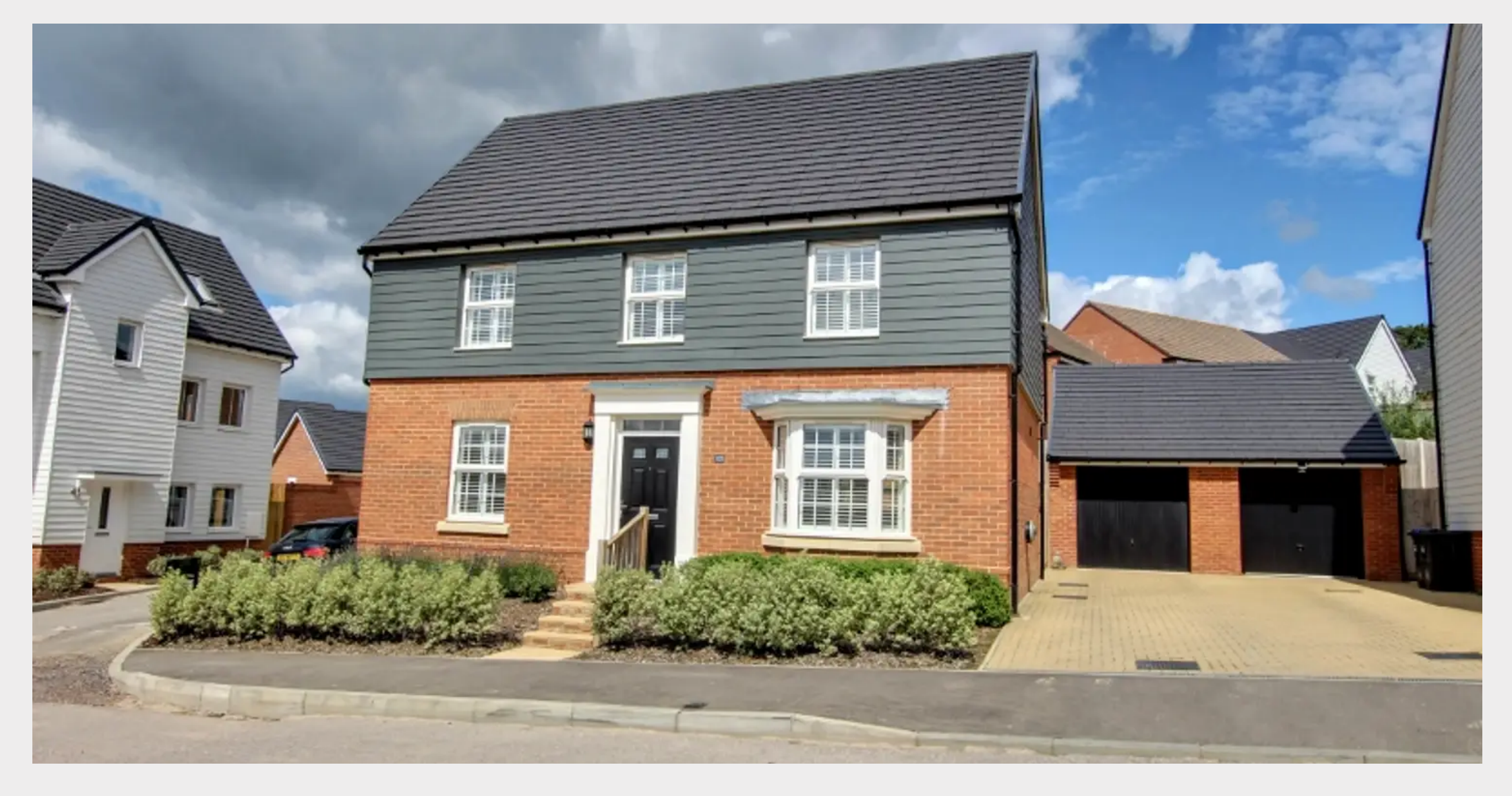
125 Virginia Drive, Haywards Heath, West Sussex RH16 4XW FREEHOLD