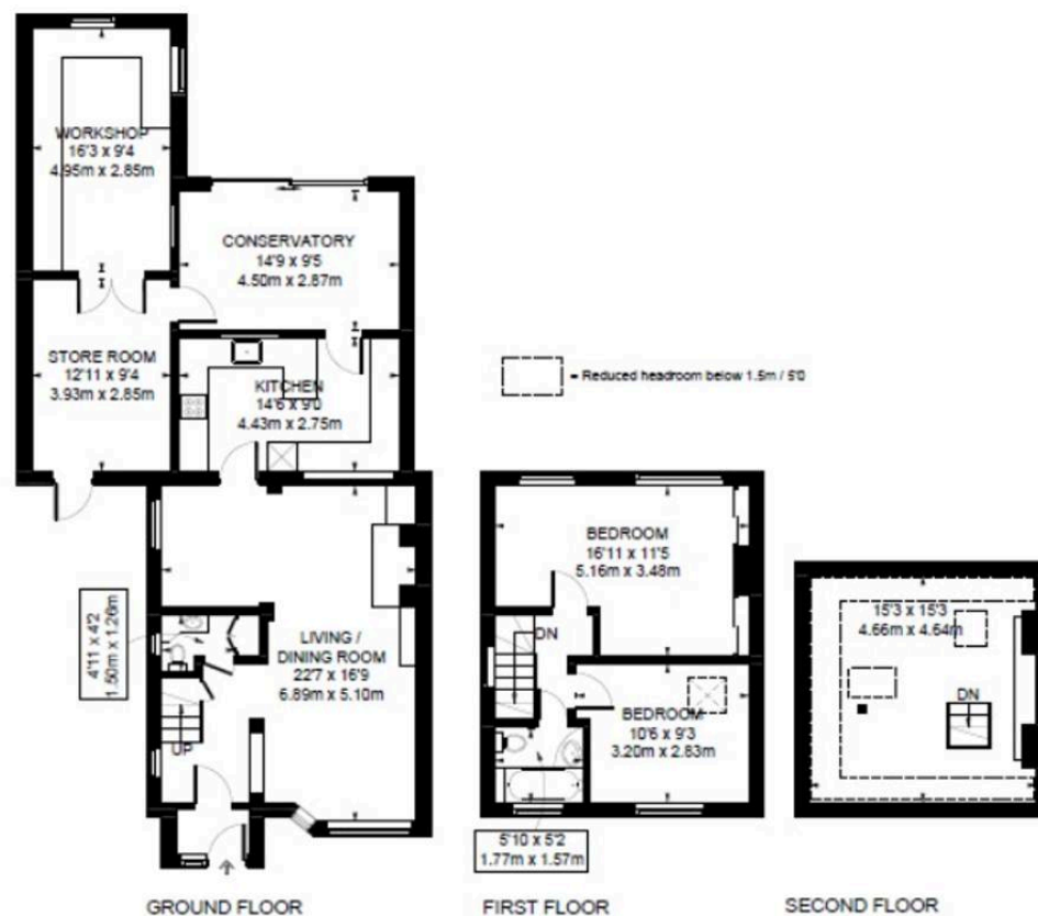
Illustration for identification purposes only. measurements are approximate, not to scale. (ID1163555)