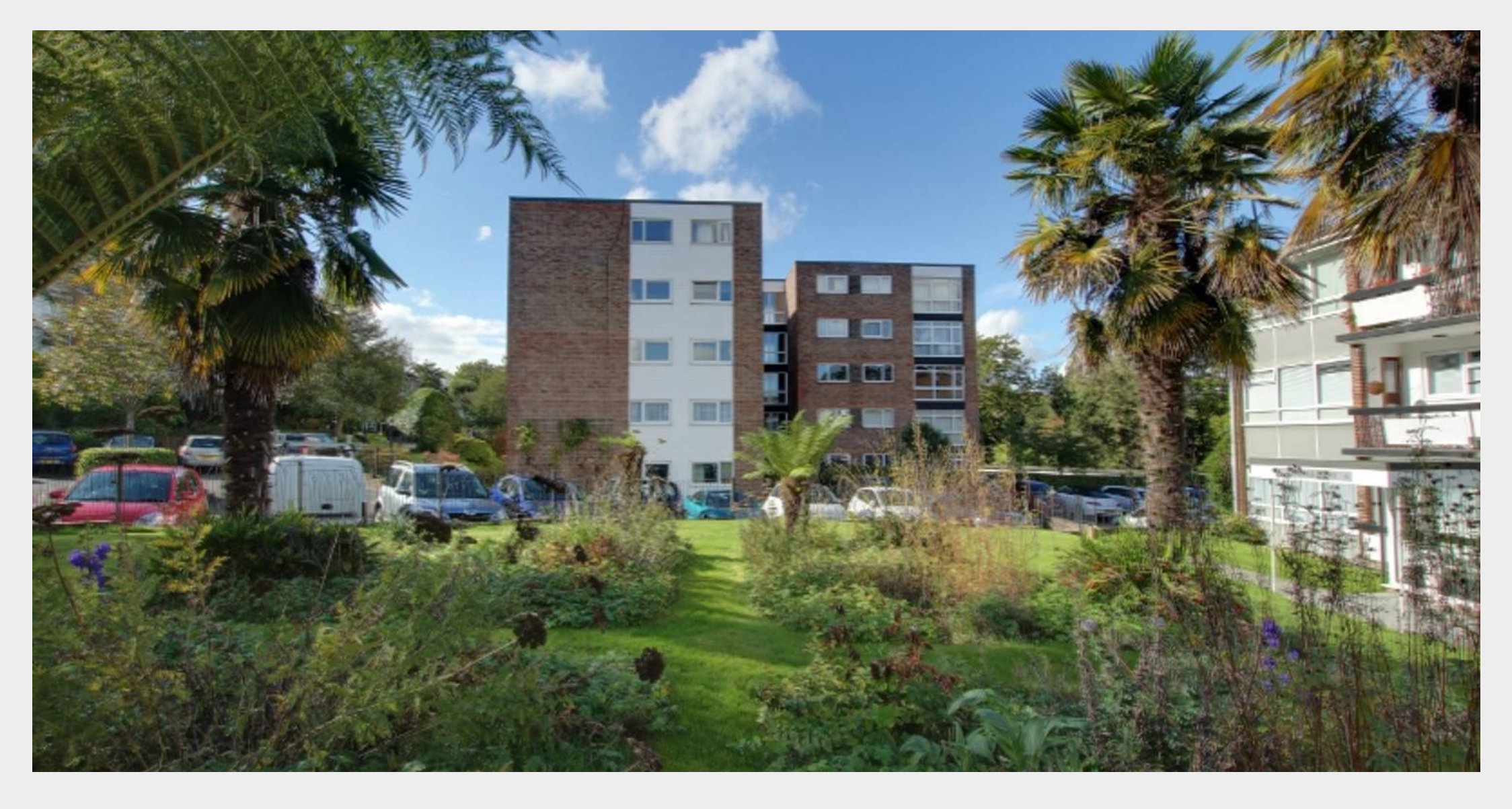
13 Kipling Court Paddockhall Road, Haywards Heath, West Sussex RH16 1EX

GUIDE PRICE ... £235,000-£250,000 ... LEASEHOLD WITH SHARE OF FREEHOLD