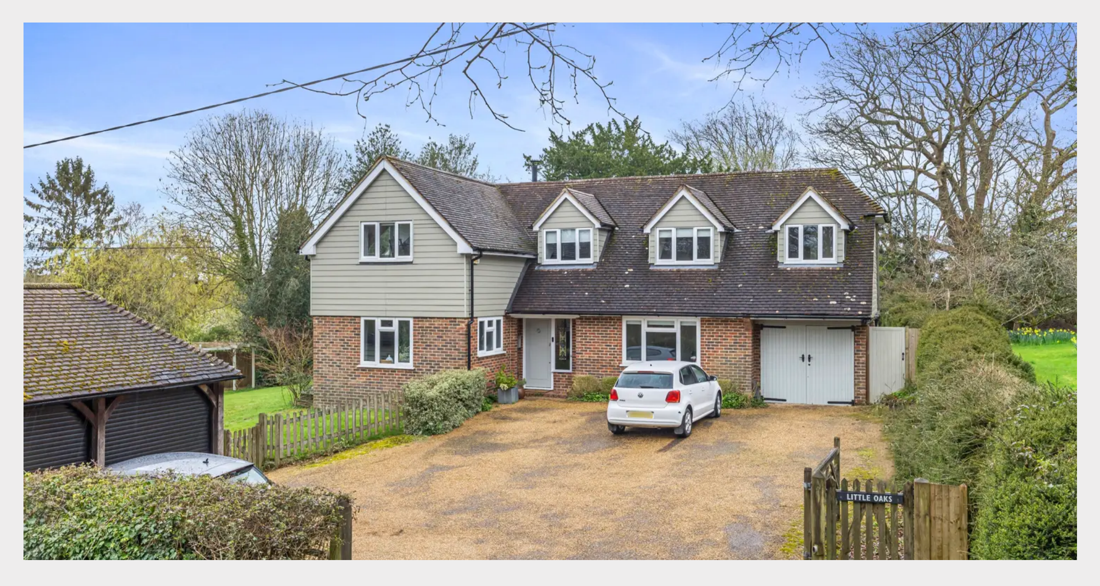
Little Oaks, Beresford Lane, Plumpton Green, East Sussex BN8 4EN

GUIDE PRICE ... £1,000,000-£1,100,000 ... FREEHOLD