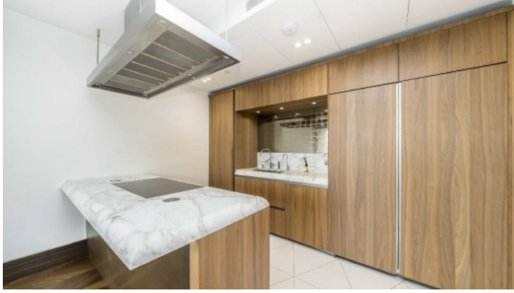
Crown Square, SE1