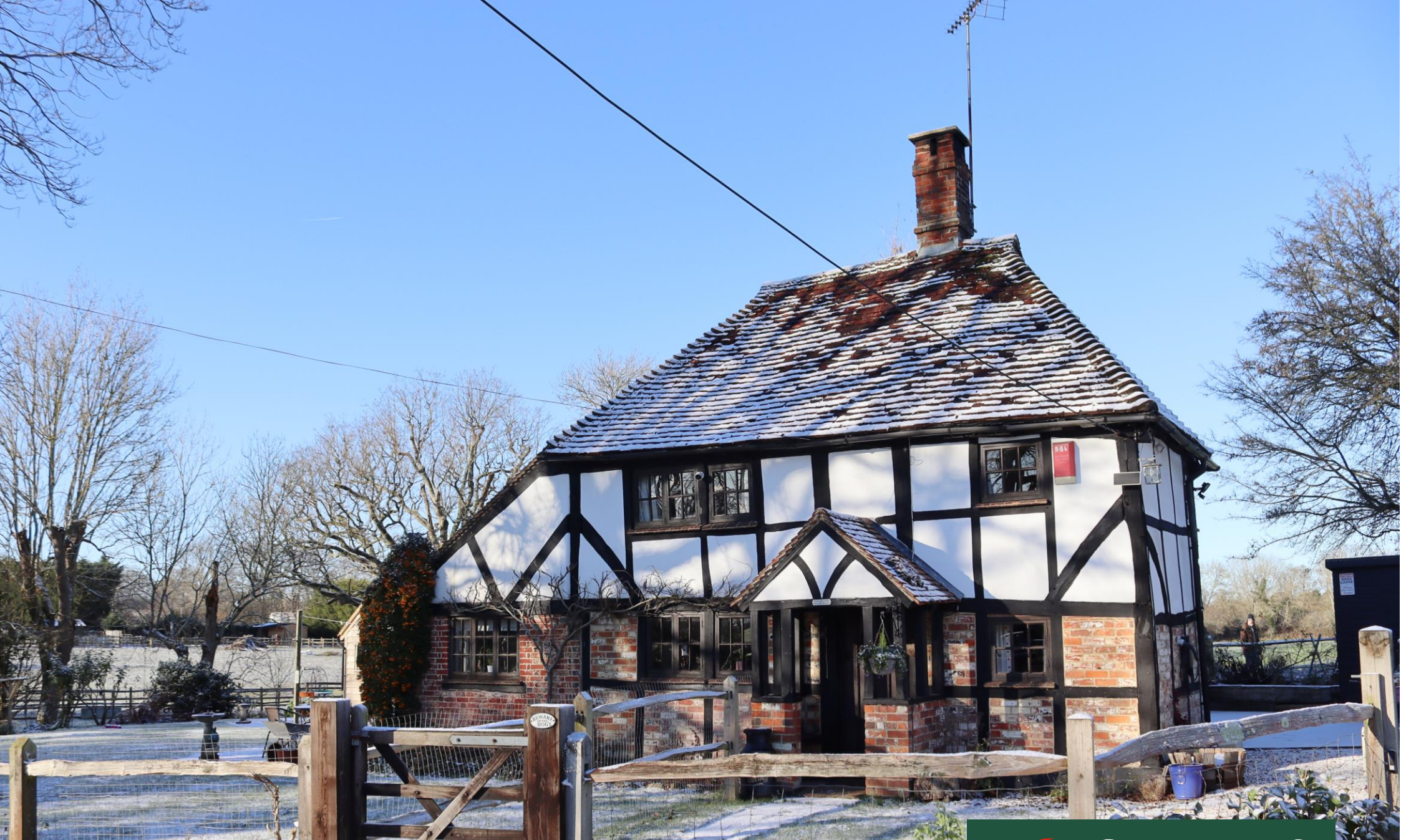
Yew Tree Cottage | West Chilington Lane | Coneyhurst | RH13 0SD