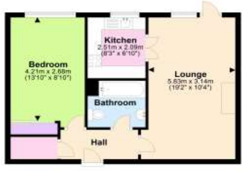
Total area: approx. 47.0 sq. metres (505.8 sq. feet) Those trawings are for representational parabolish styl. Drawn by Brian Mantee.