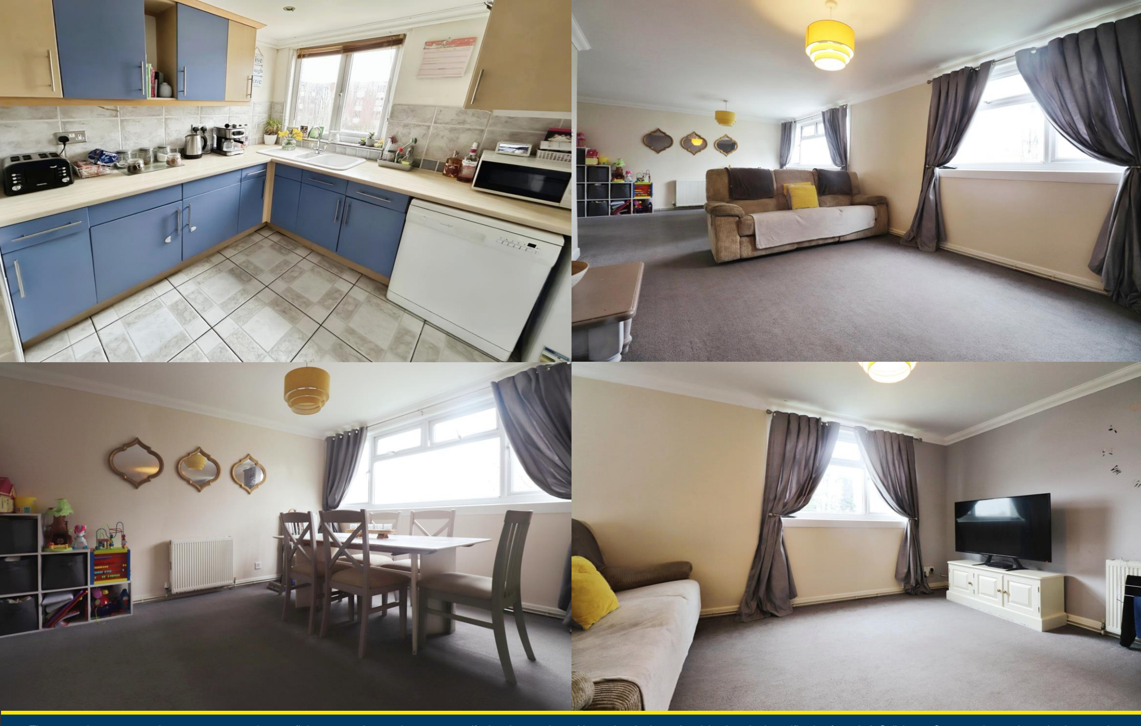
The agents have not tested any apparatus, equipment, fittings or services and so cannot verify that they are in working order, the buyer is advised to obtain verification from their Solicitor or Surveyor. Items shown in photographs are not necessarily included in the sale. The room measurements are given for guidance only and should not be relied upon when ordering such items as furniture, appliances and carpets. While we endeavour to make sales particulars accurate and reliable, they are only a general guide to the property and accordingly, if there is any point which is of particular importance to you, please contact the office and they will be pleased to check the position for you, especially if you are contemplating traveling some distance to view a property. Confirmation of these draft property particulars is currently awaited from the vendor, therefore you are notified that the Agent holds no responsibility for any inaccuracies that may be contained within.