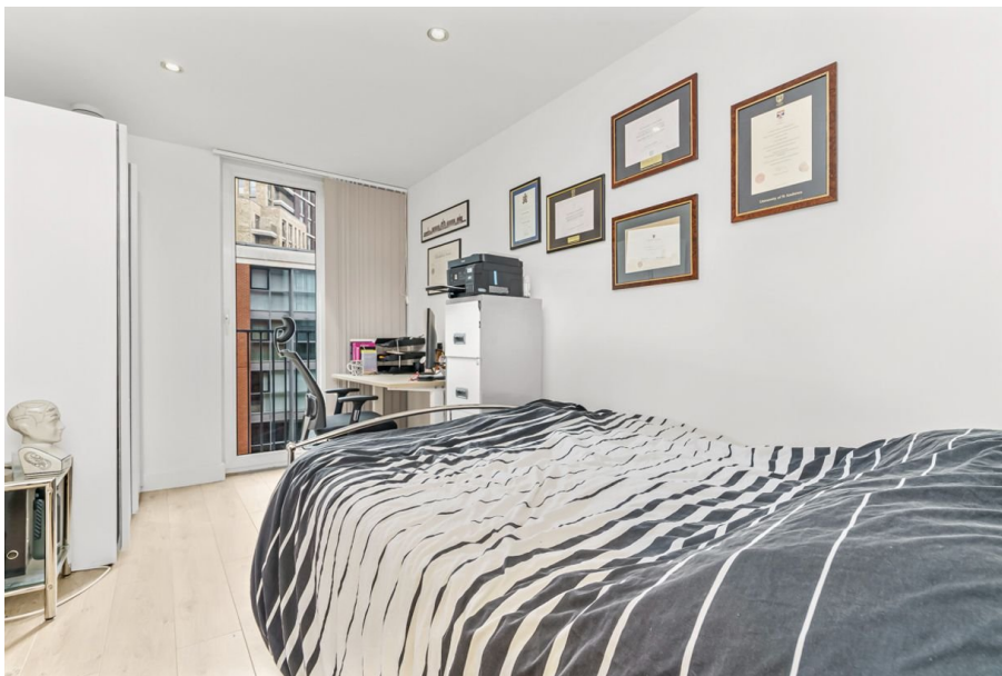
Capital East Apartments