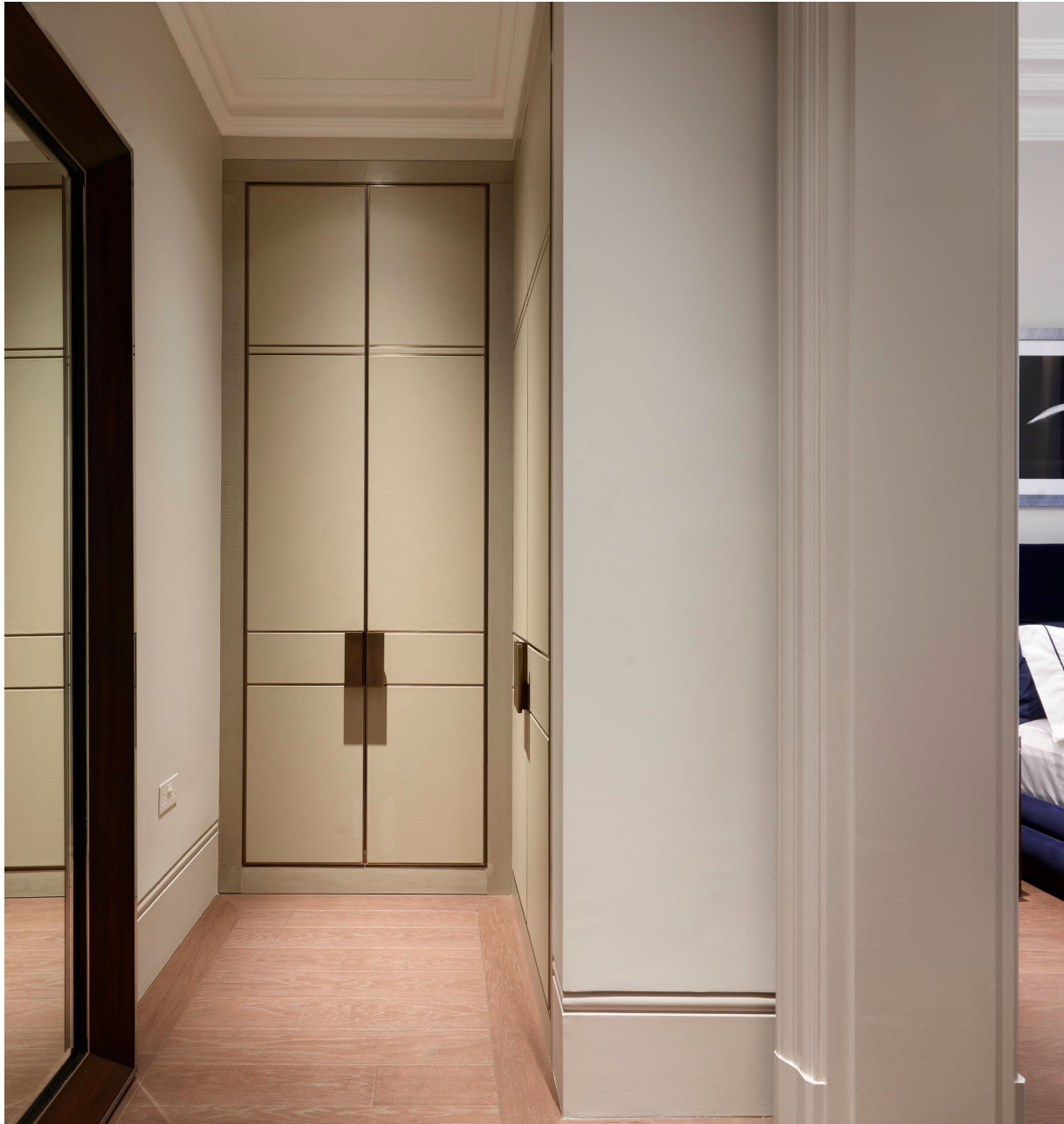
Plentiful storage with separate dressing area