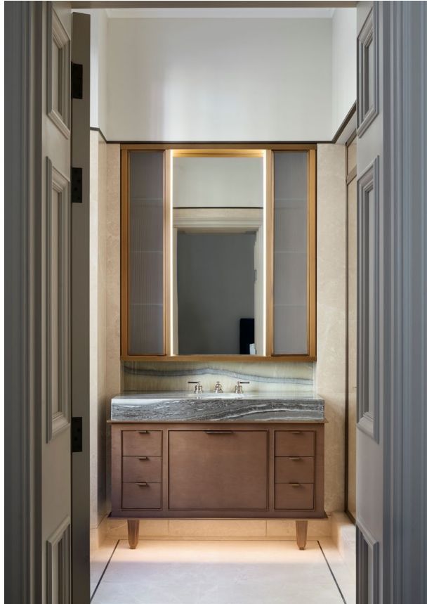
Beautiful bathroom detail with onyx marble vanity