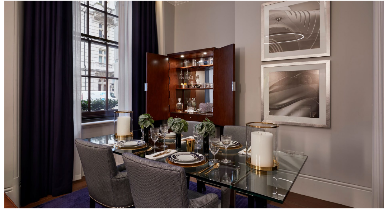
Distinct furniture by Ralph Lauren