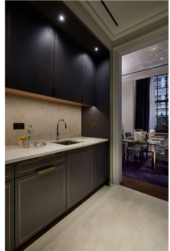
Bespoke kitchen cabinetry by British company Smallbone of Devizes