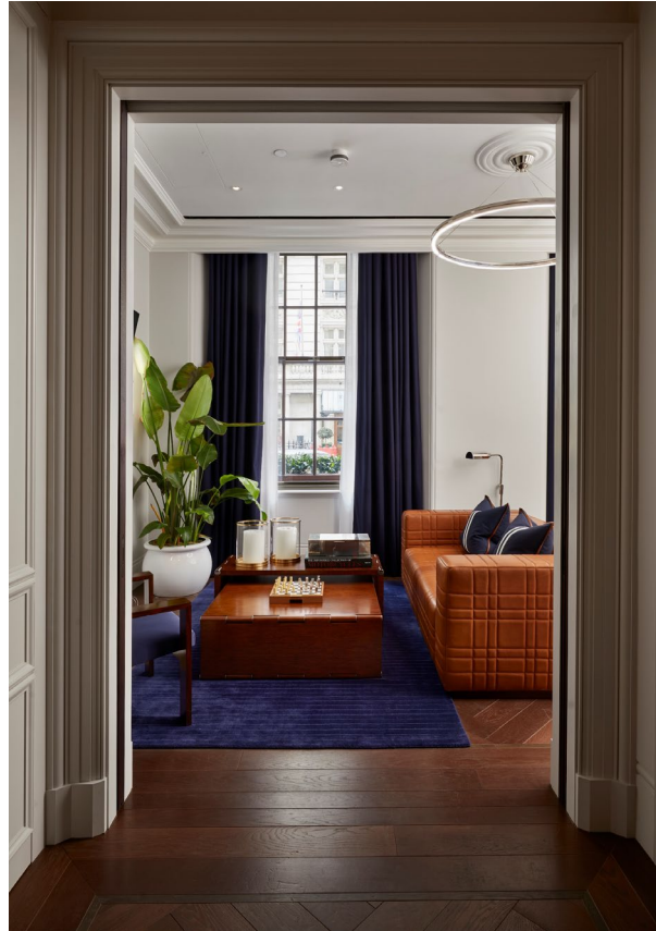
Classic Edwardian detail and 3.3-meter ceiling height