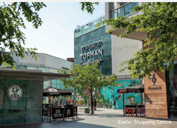
Exeter Shopping Centre