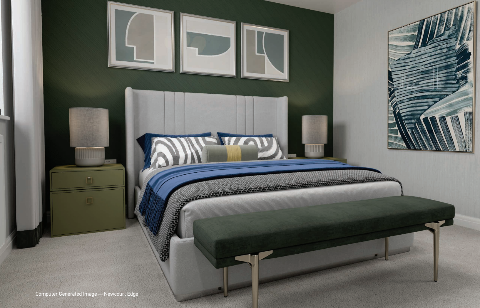
Computer Generated Image — Newcourt Edge