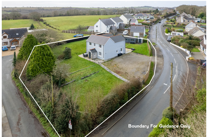
Boundary For Guidance Only