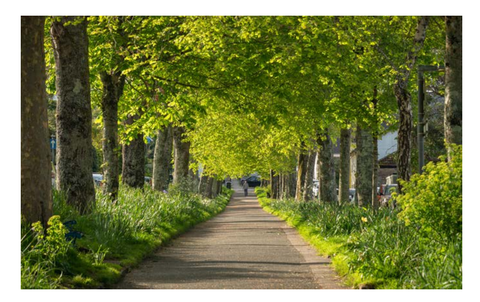
ABOVE & RIGHT Tree-lined Arwenack Avenue & Gyllyngvase Beach, Falmouth

The Cornish coastline isn't far away with a rich maritime history, Falmouth remains a premier sailing spot and boasts multiple beaches across the bay which stretches out from Pendennis Point.