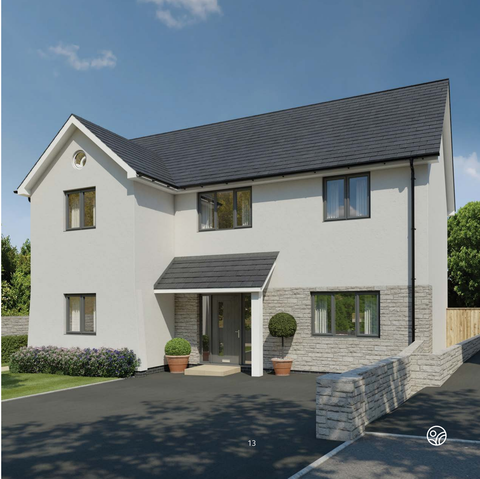
RIGHT Chestnut house type