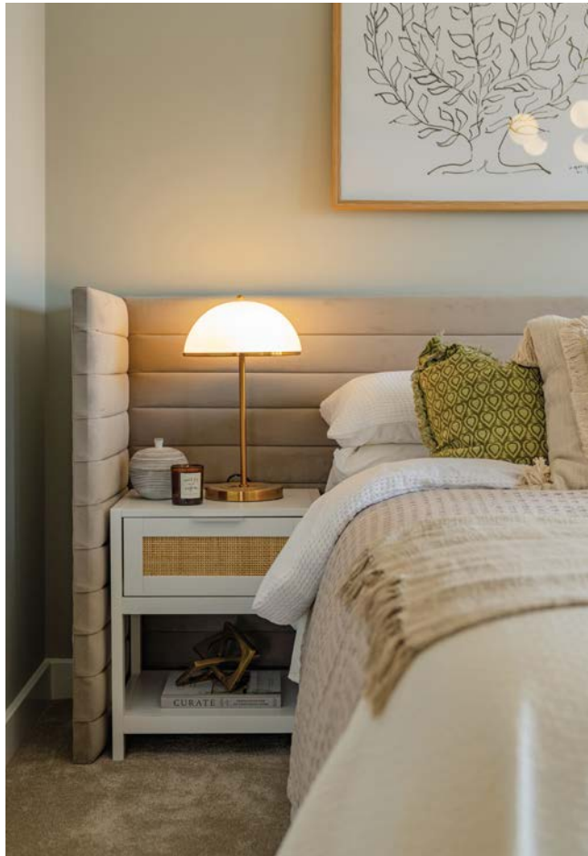
ABOVE & RIGHT Typical Devonshire Homes interiors — not site specific