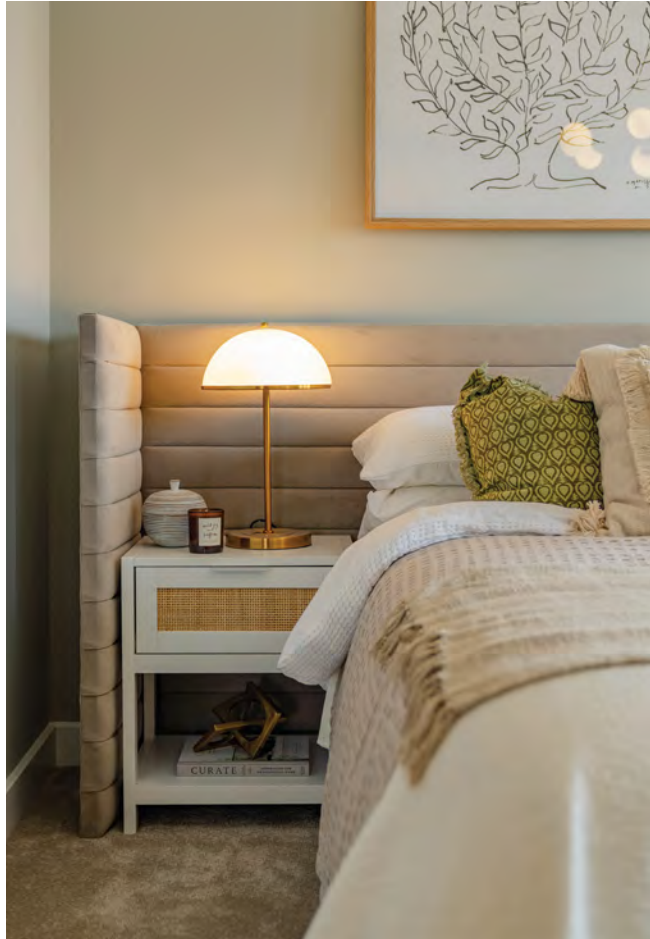
ABOVE & RIGHT Typical Devonshire Homes interiors — not site specific