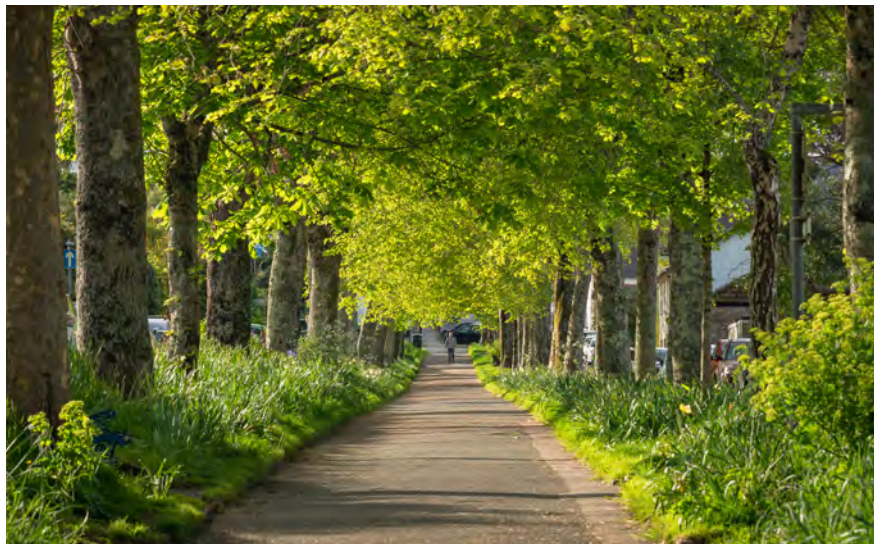
ABOVE & RIGHT Tree-lined Arwenack Avenue & Gyllyngvase Beach, Falmouth

The Cornish coastline isn't far away — with a rich maritime history, Falmouth remains a premier sailing spot and boasts multiple beaches across the bay which stretches out from Pendennis Point.