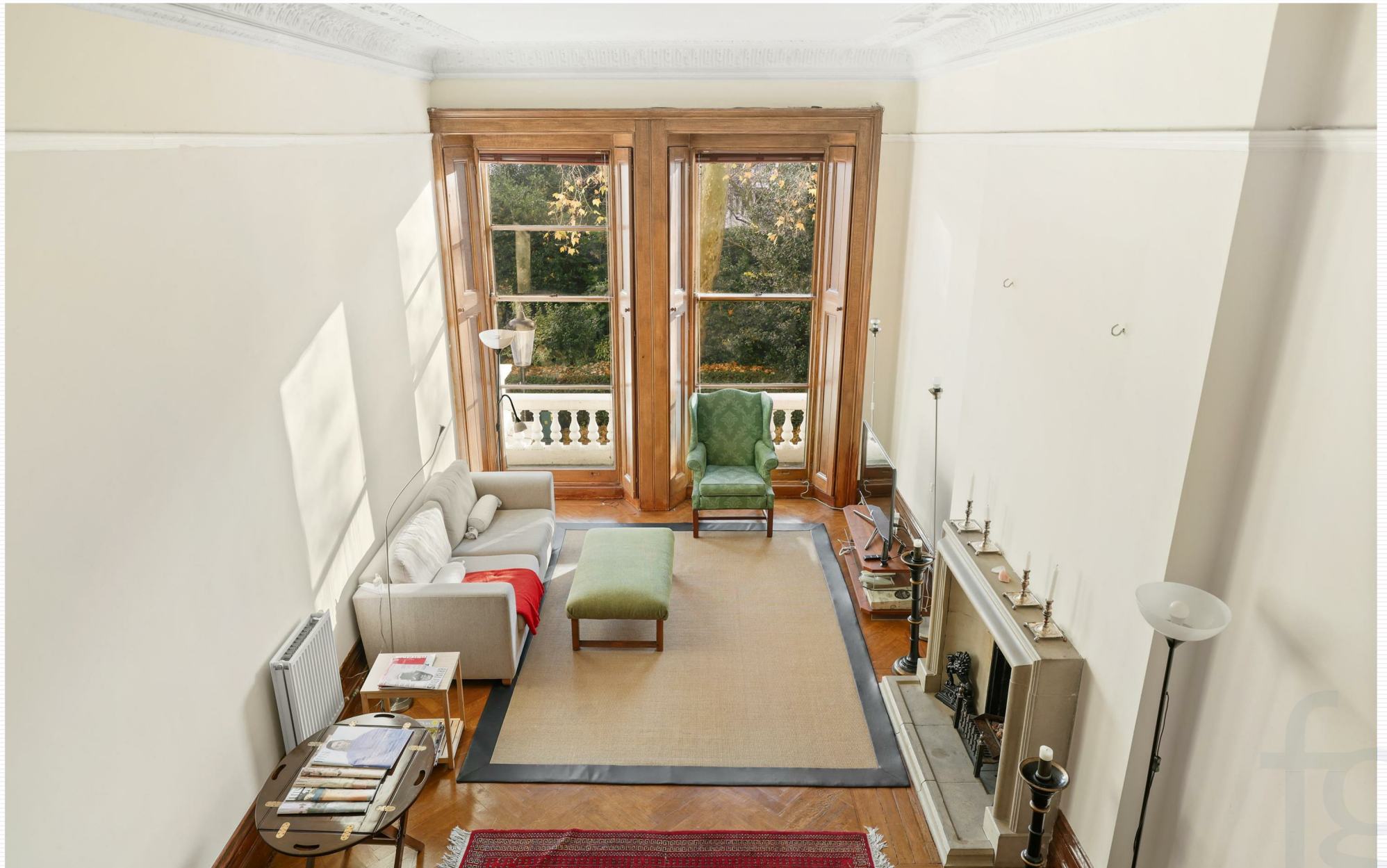
Cornwall Gardens, South Kensington, SW7 4AL

Guide Price £1,950,000 Share of Freehold