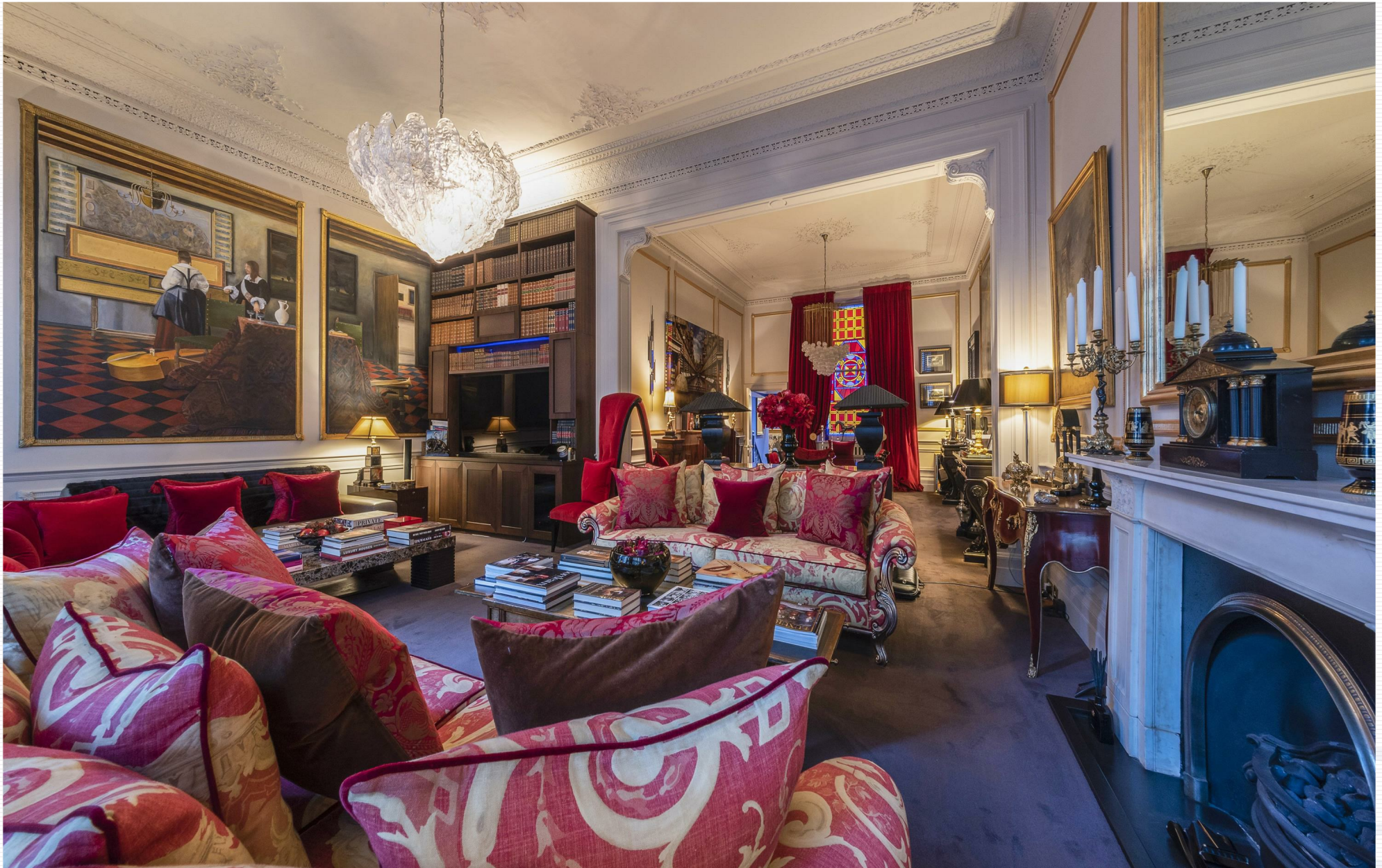
Palace Gate, Kensington, W8 5LS

Guide Price £5,695,000 Share of Freehold