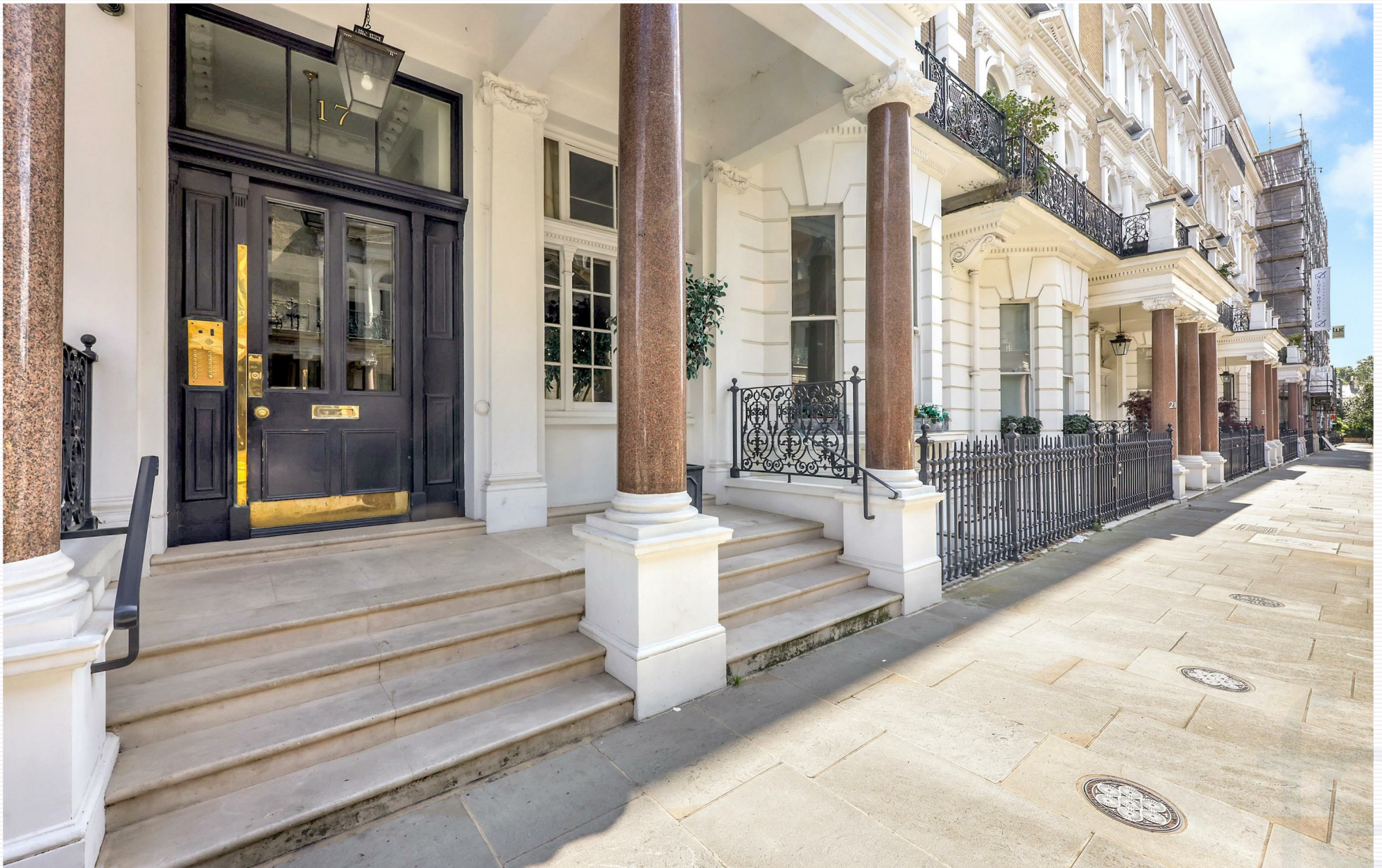
De Vere Gardens, South Kensington, W8 5AN

Guide Price £2,100,000 Share of Freehold