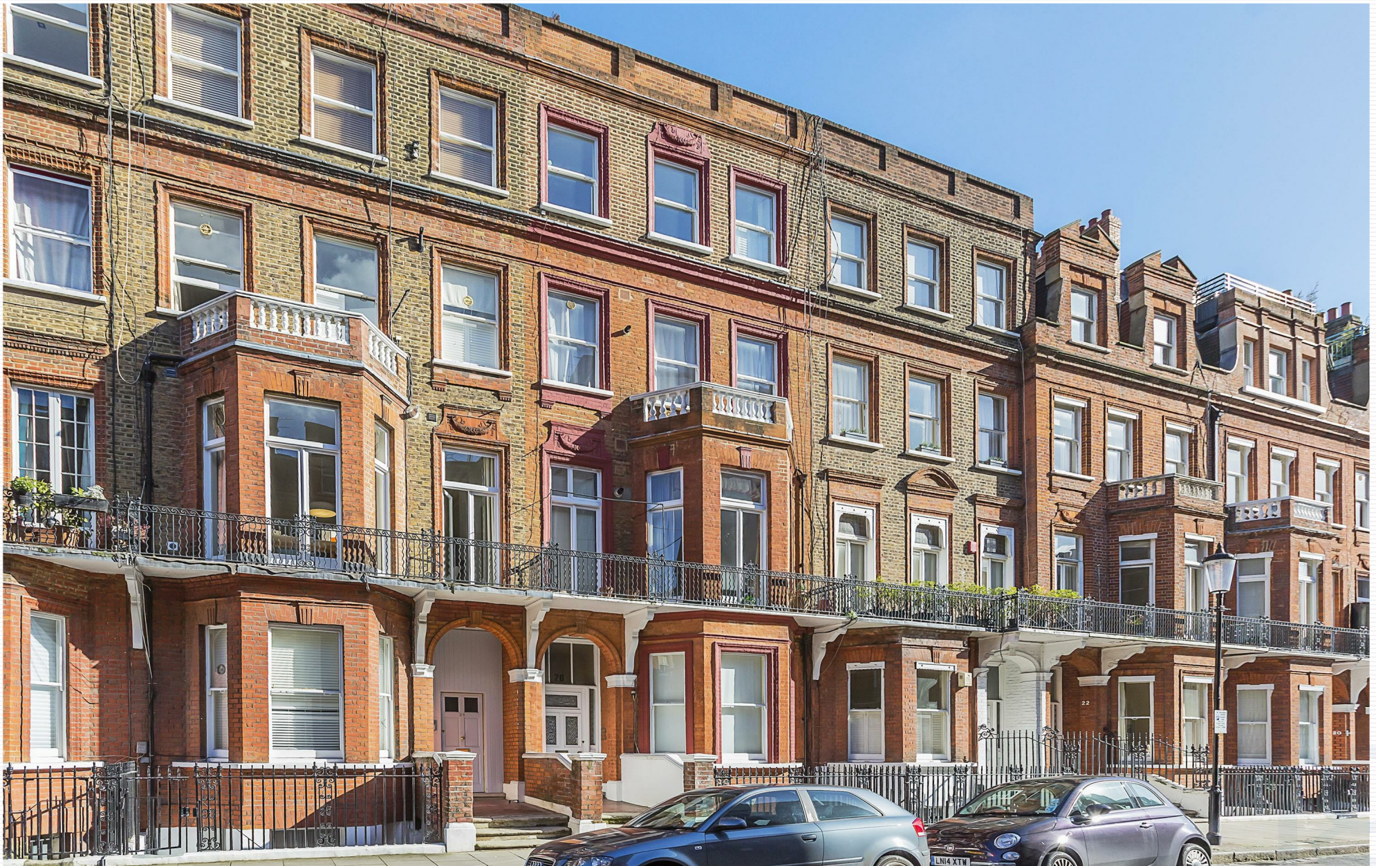
Rosary Gardens, South Kensington, SW7 4NT