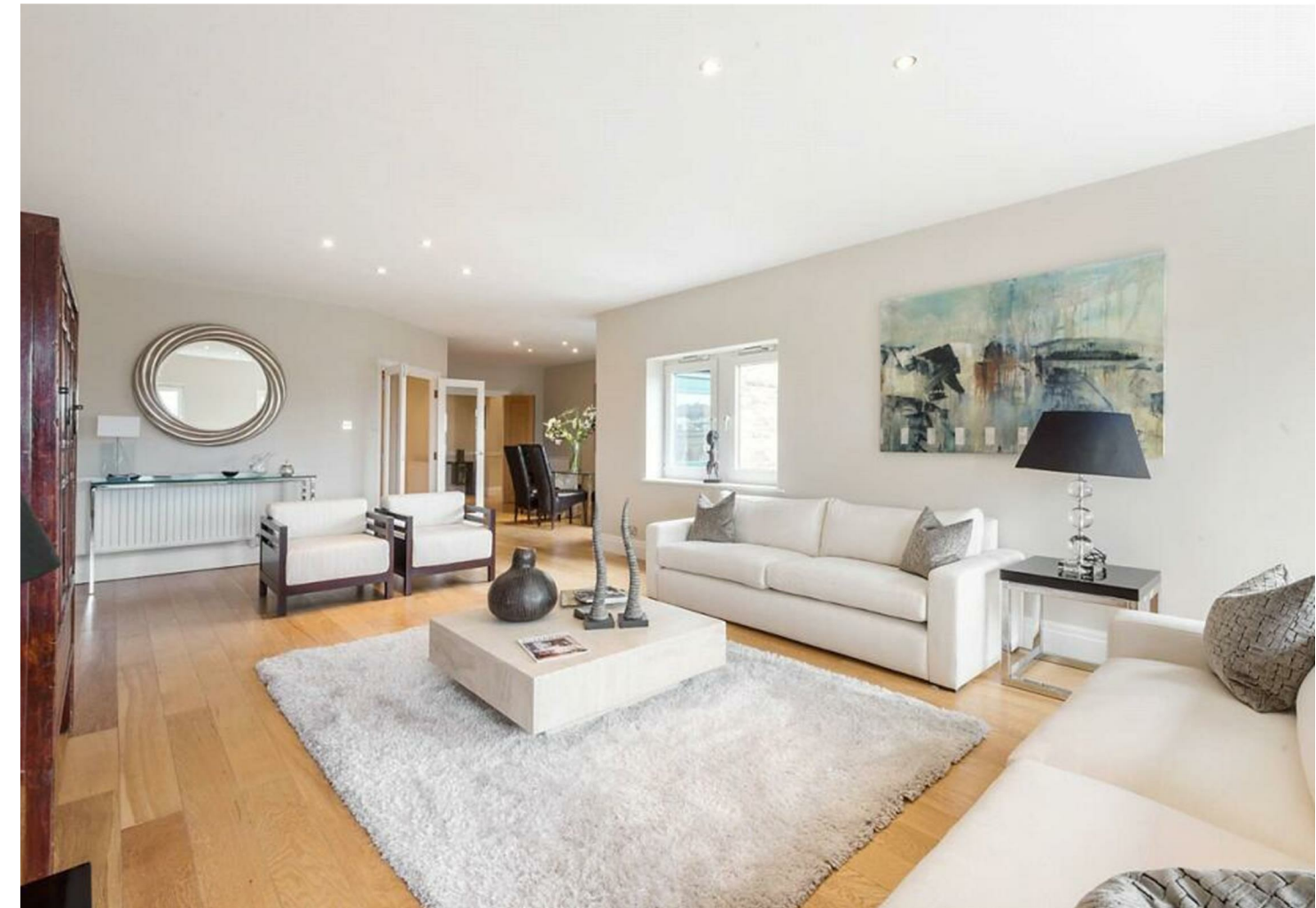
Apartment 74 Warwick Road, London, W14 8TT

TOTAL GROSS INTERNAL FLOOR AREA 1916 SQ FT 178 SQ METRES