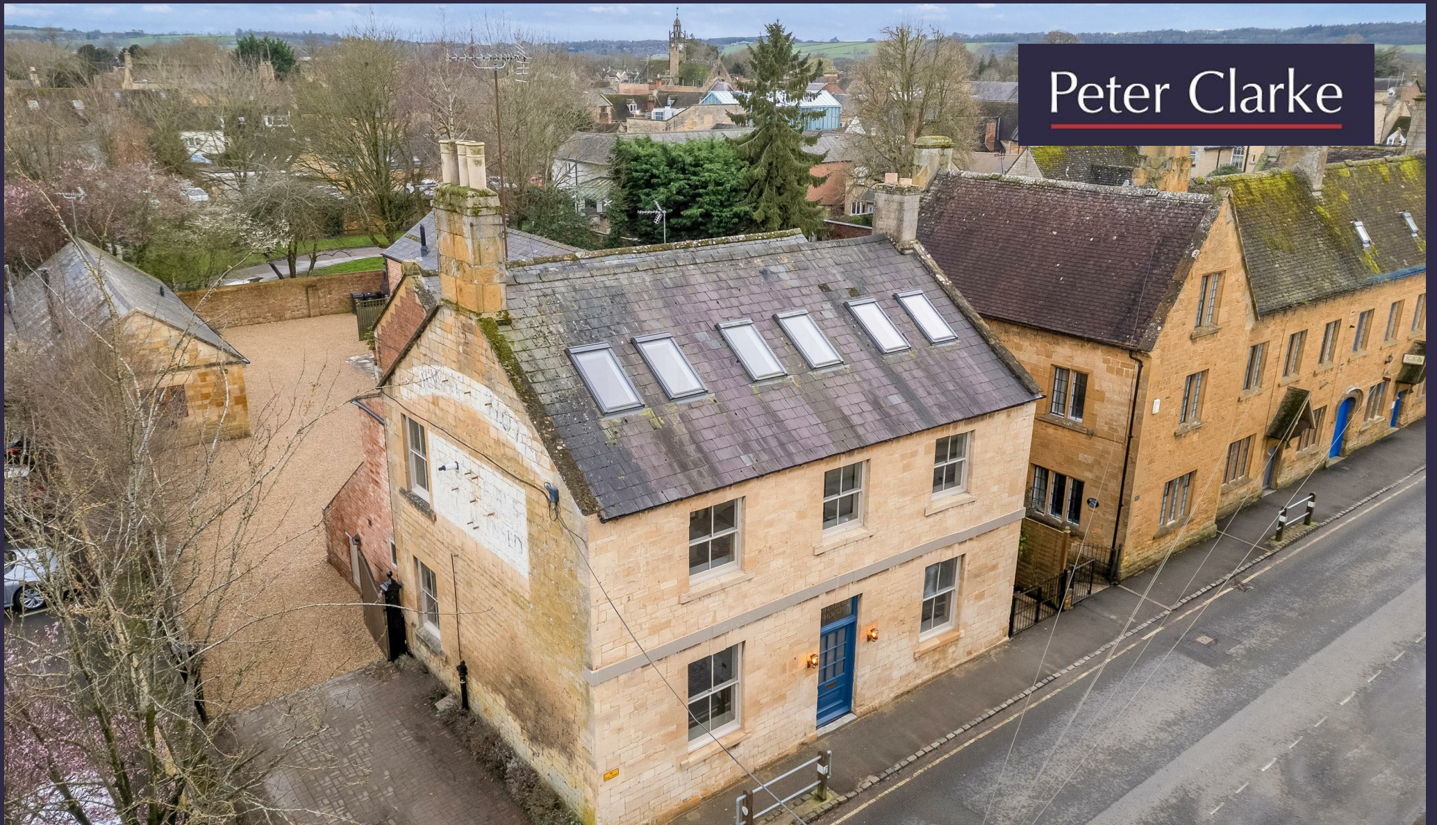
Delabere House, New Road, Moreton in Marsh, GL56 0AS