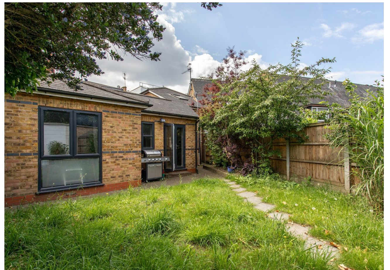
Back Garden 38'2" x 26'2"