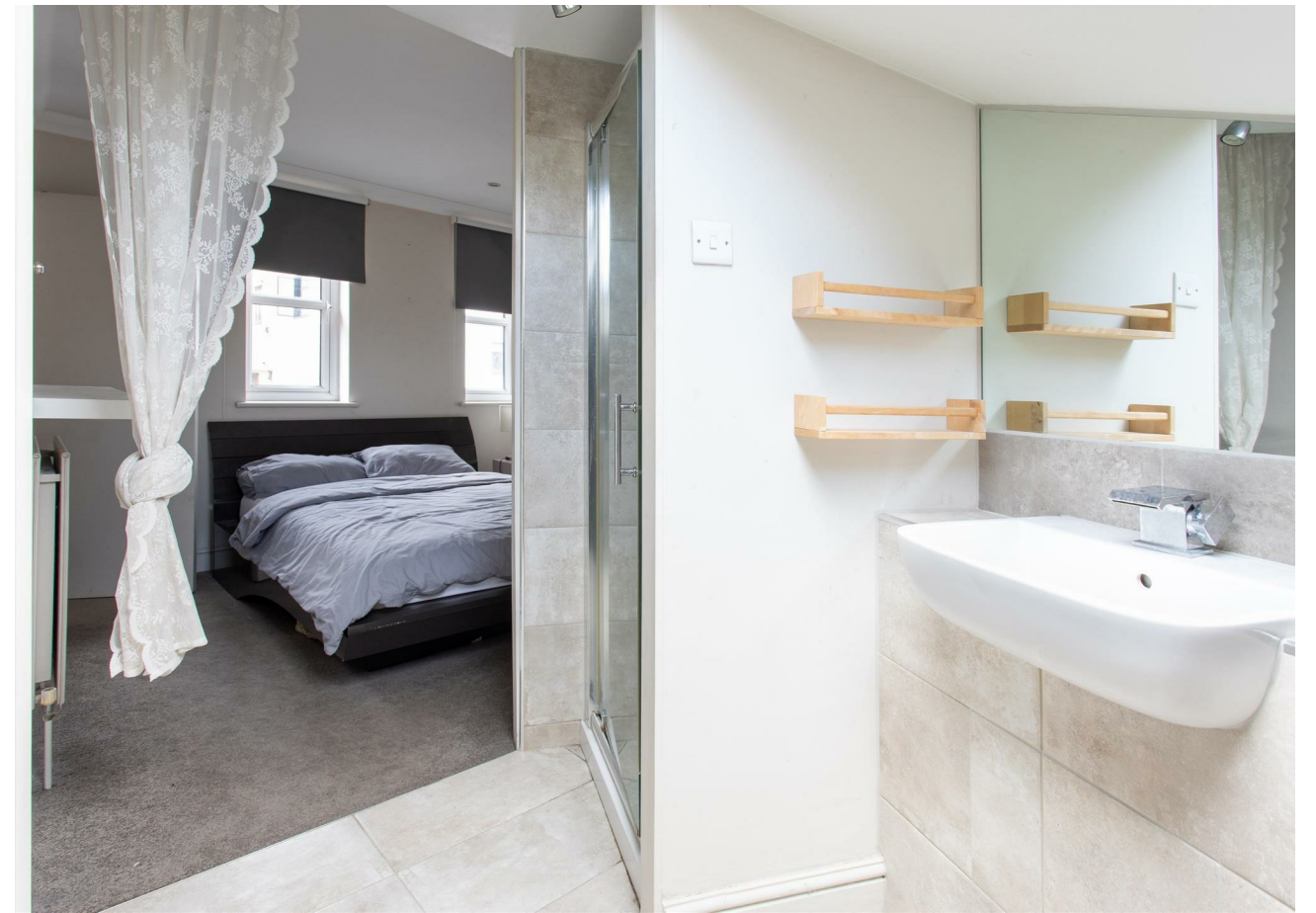
Bedroom 10'5" x 10'7"