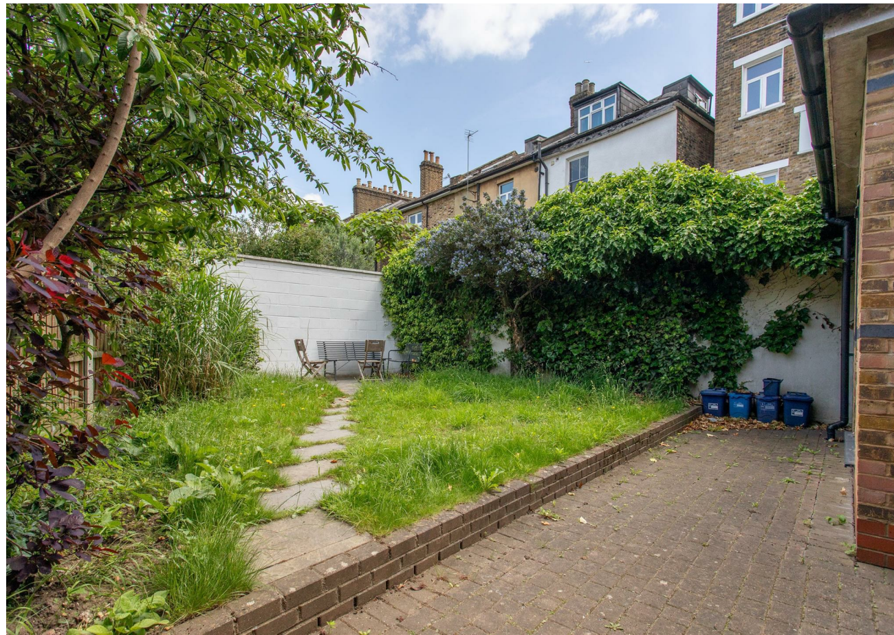
Front Garden 48'6" x 19'0"