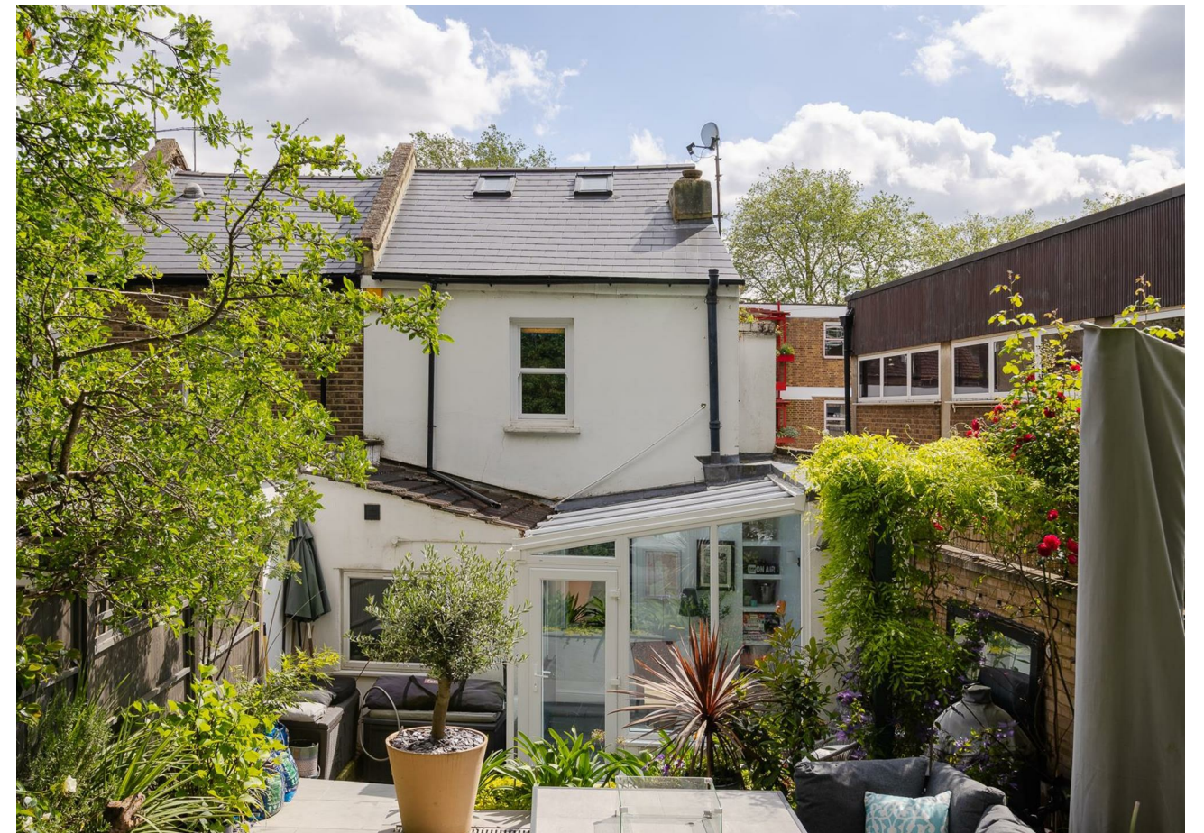
Garden approx. 45'11"