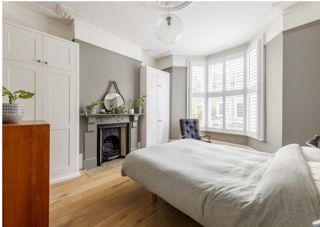
Bedroom 12'7" x 11'5"