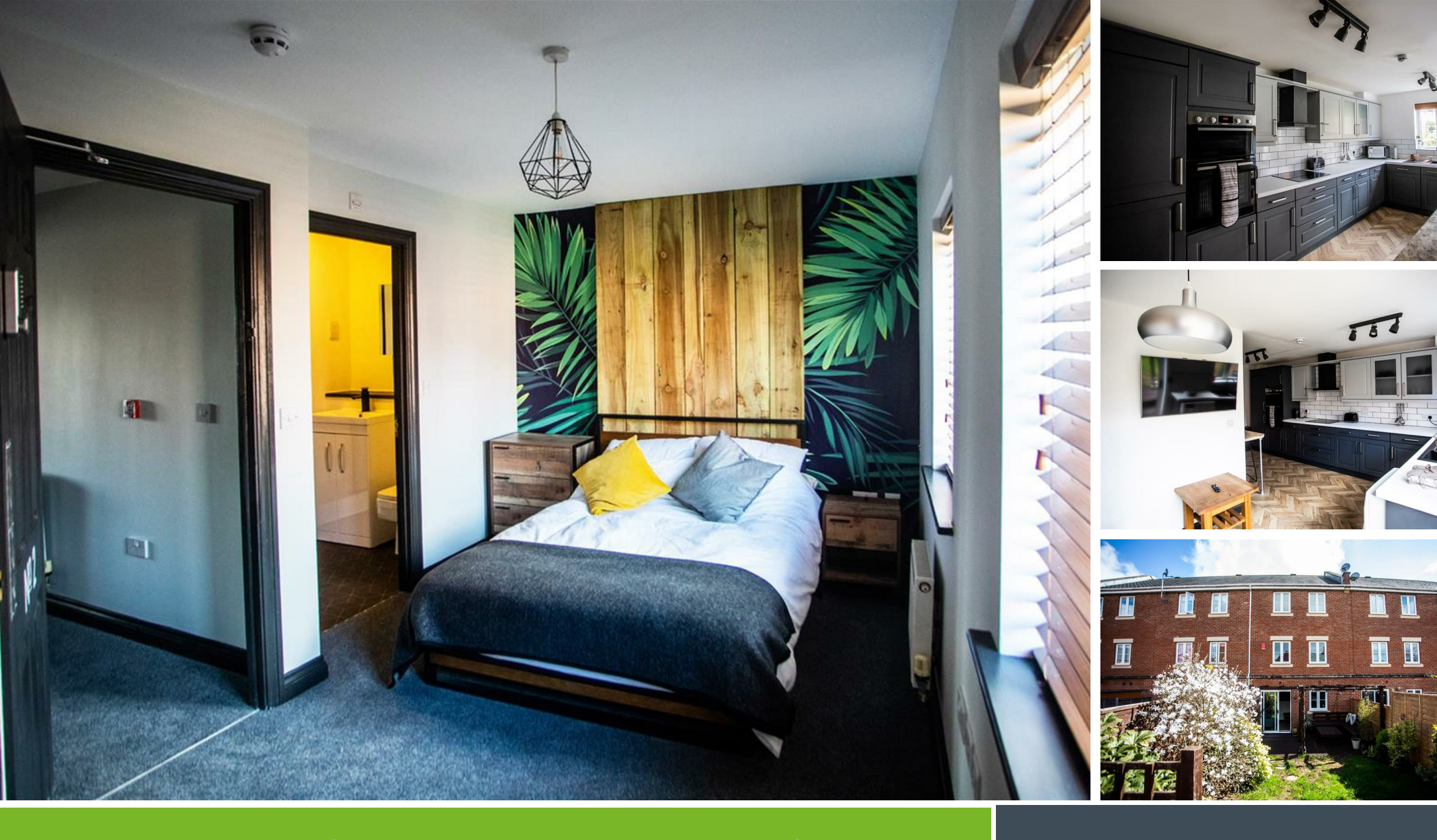
Room 2, 41 Royal Crescent, Exeter, Devon, EX2 7QT To Let £625 PCM