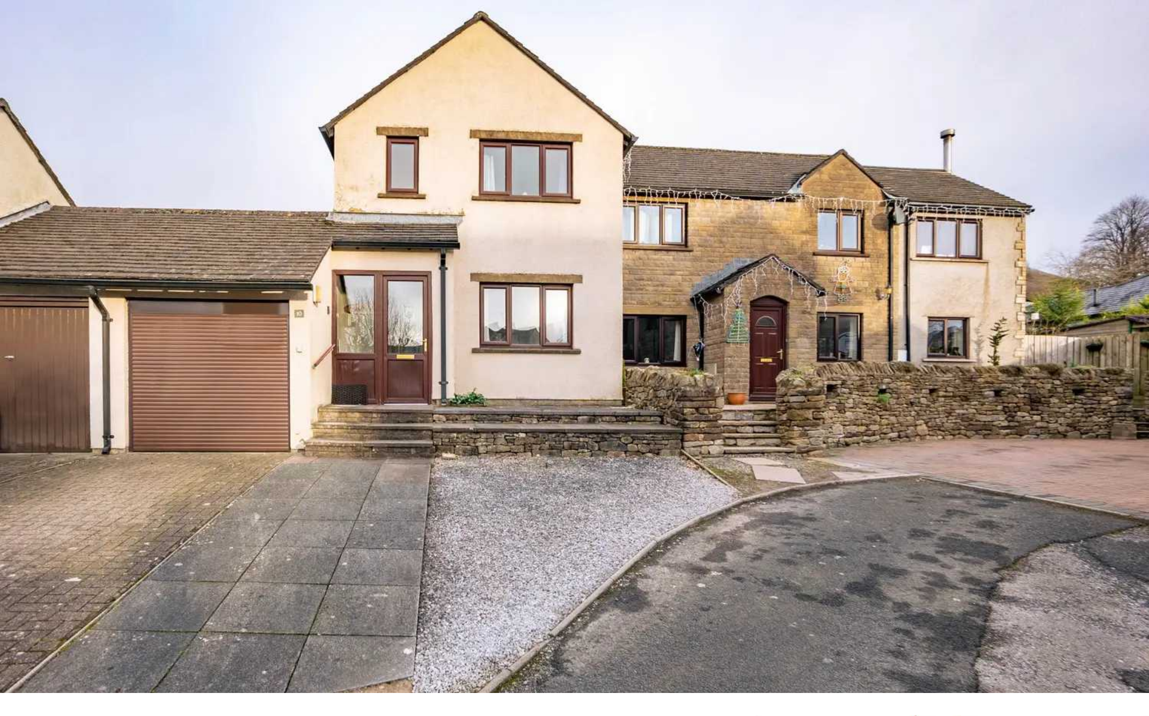
10 Guldrey Fold, Sedbergh £279,950 Freehold