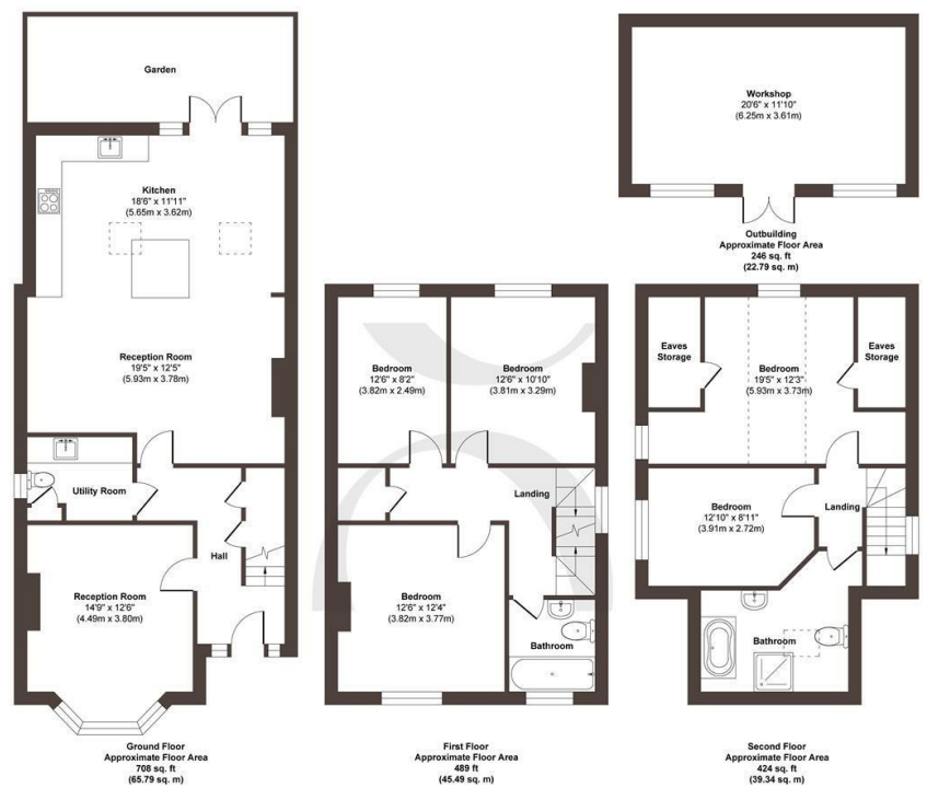
Approx. Gross Internal Floor Area 1867 sq. ft / 173.41 sq. m