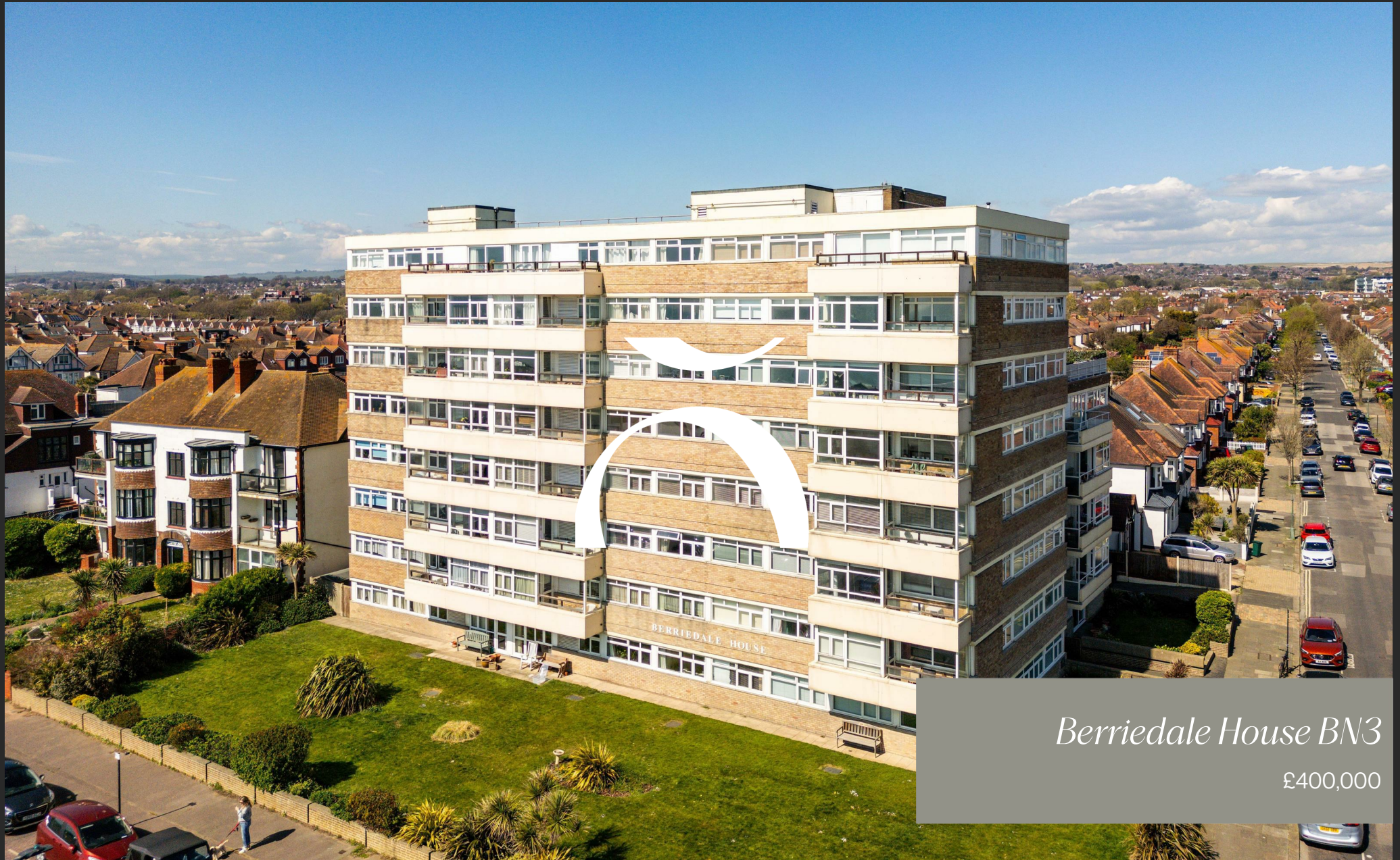
Berriedale House BN3