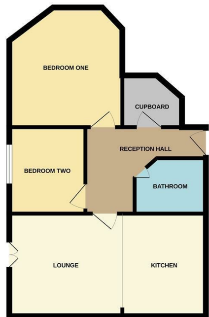
TOTAL FLOOR AREA: 540 sq.ft. (50.1 sq.m.) approx. The plan is not drawn to scale and is for illustrative purposes only. Made with Metropex 02/24