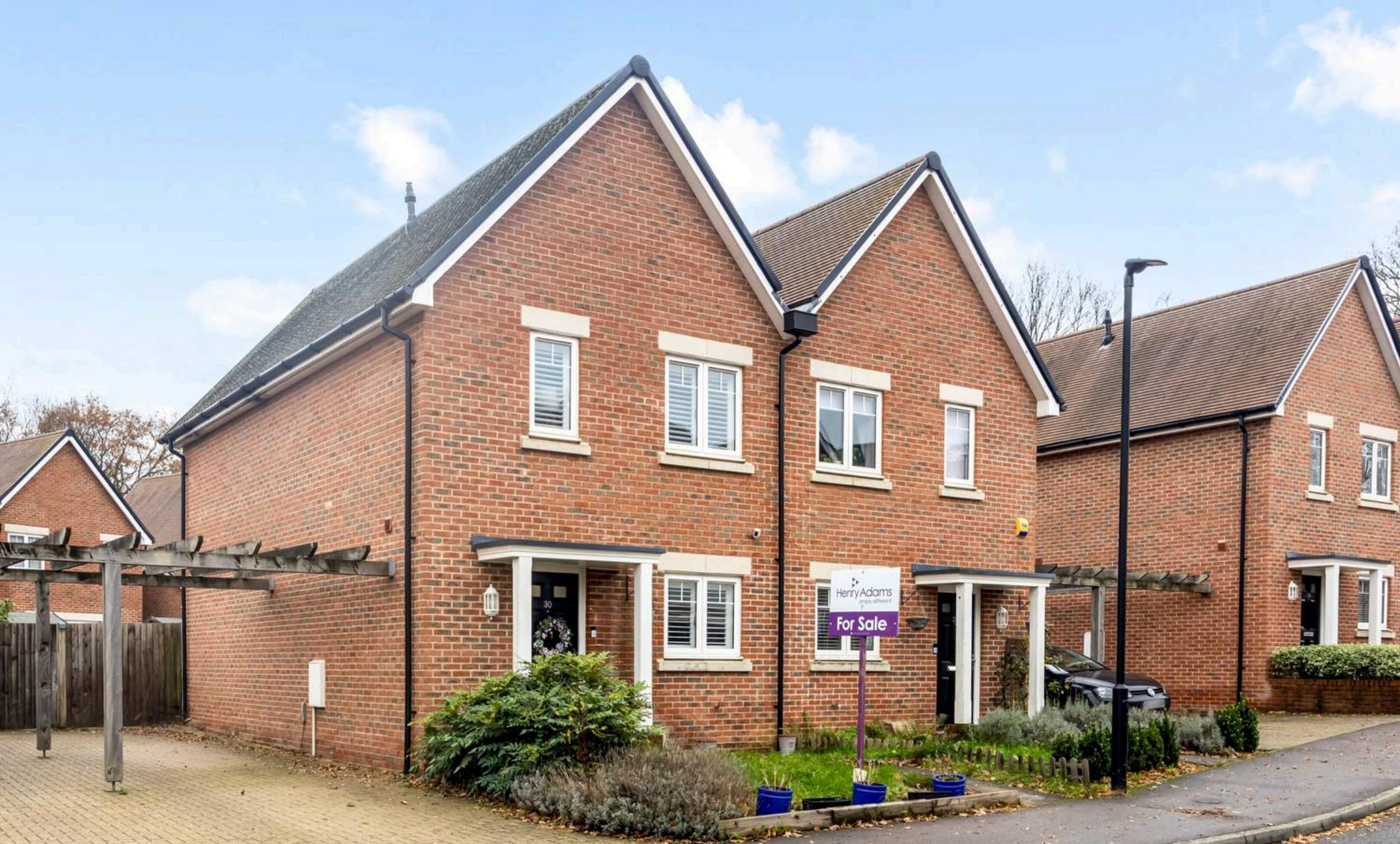
30 Beacon Crescent, Burgess Hill £415,000