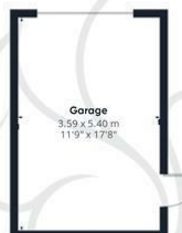
Ground Floor Building 4