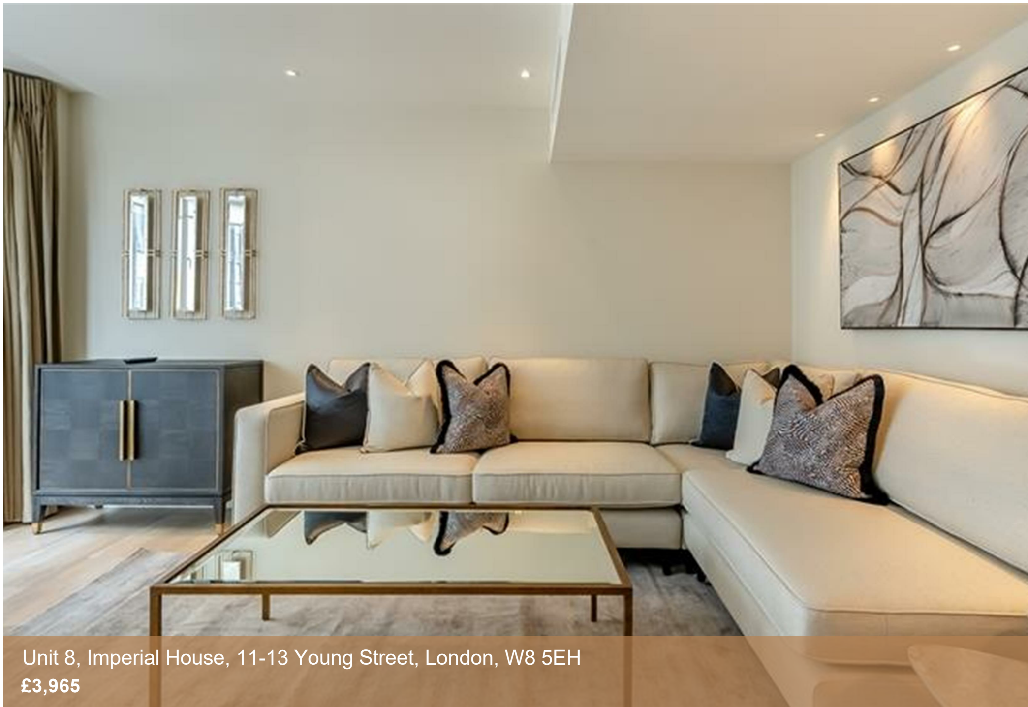
Unit 8, Imperial House, 11-13 Young Street, London, W8 5EH £3,965