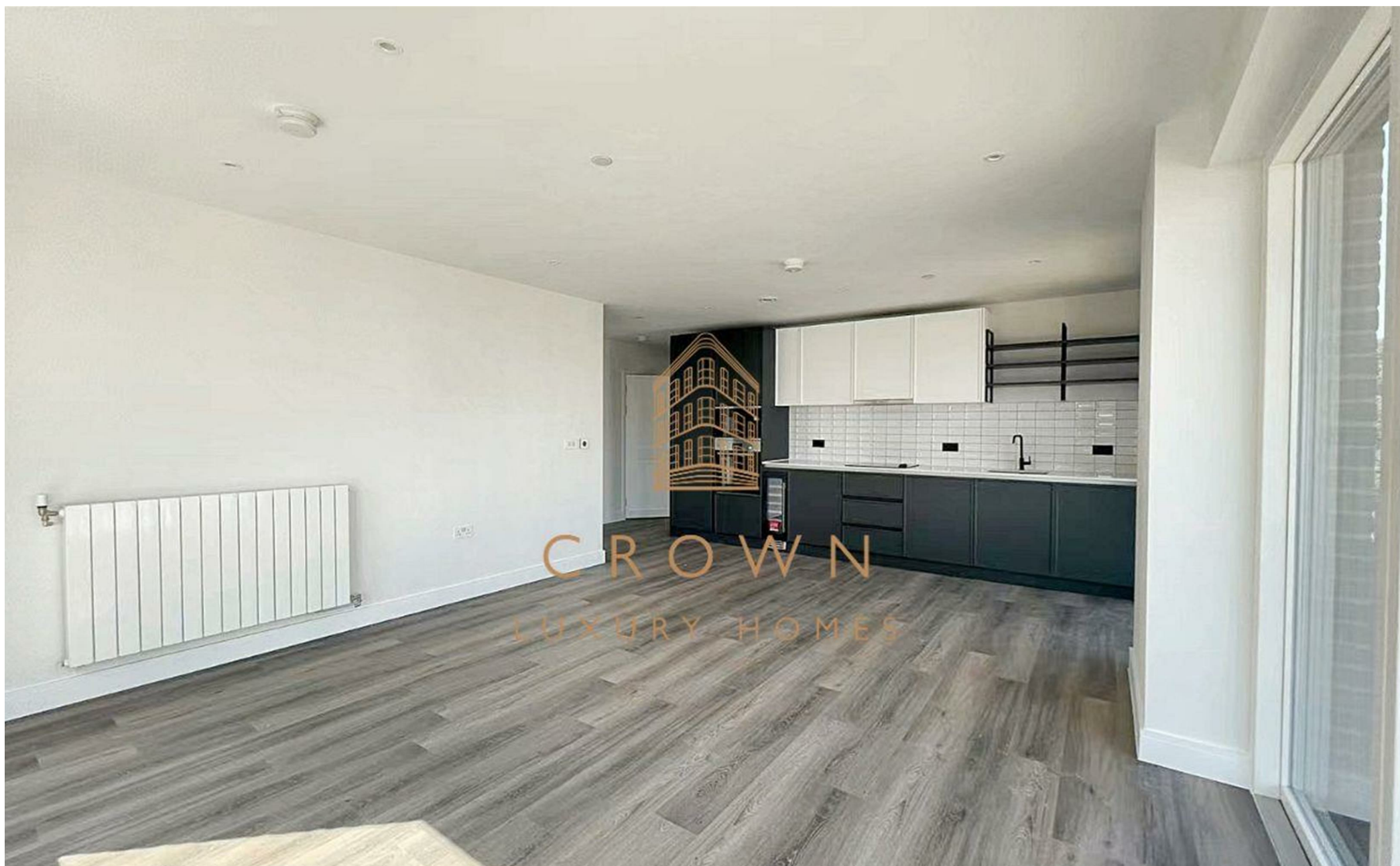
308 Cairncross House 17 Townsend Road, Kidbrooke, SE3 9BZ £3,250