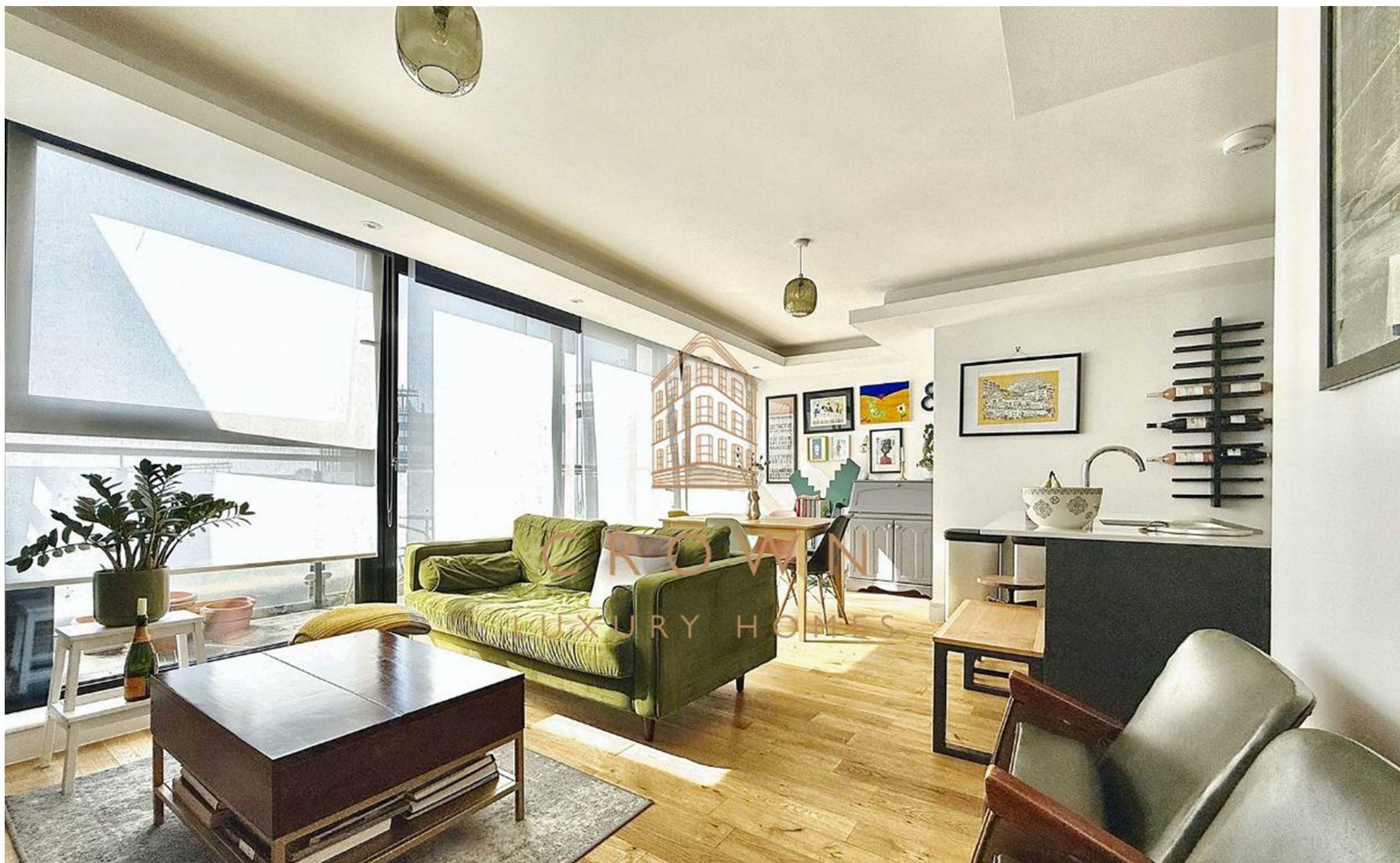
Flat 21, 706 High Road, London, N12 9QL £375,000