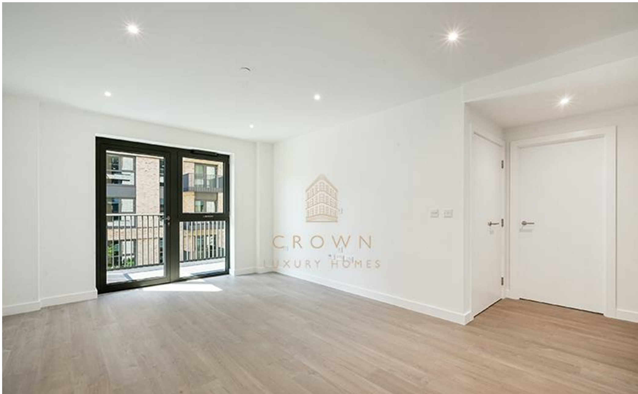
21 Azure Apartments Dragonfly Walk, London, N4 2WS £2,200