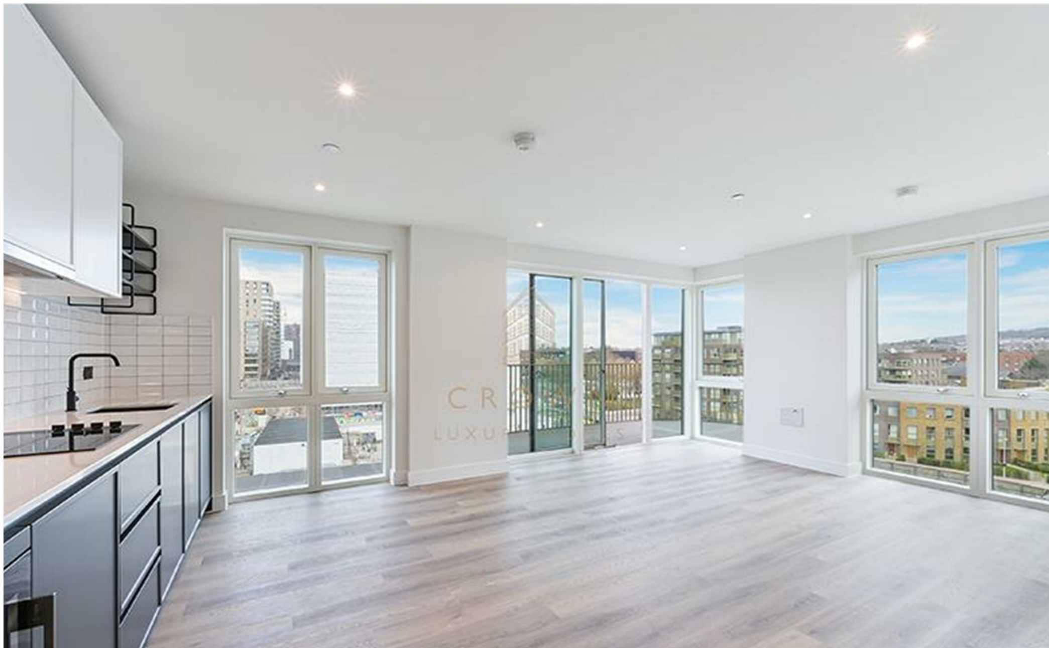
508, Cairncross House 17 Townsend Road, London, SE3 9BZ £3,000