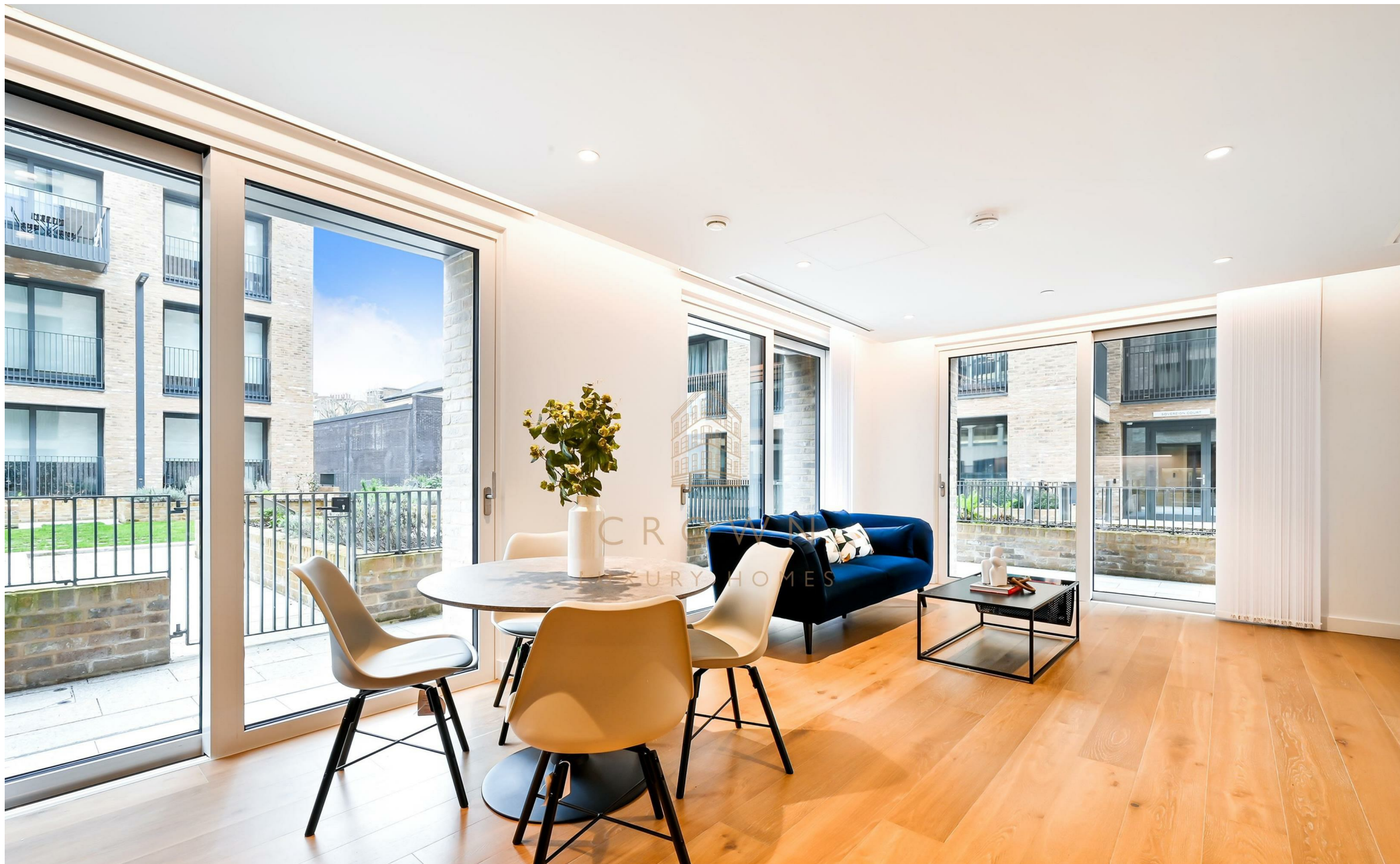
4 Signature House 4 Jubilee Walk, London, WC1X 0BF £1,000,000