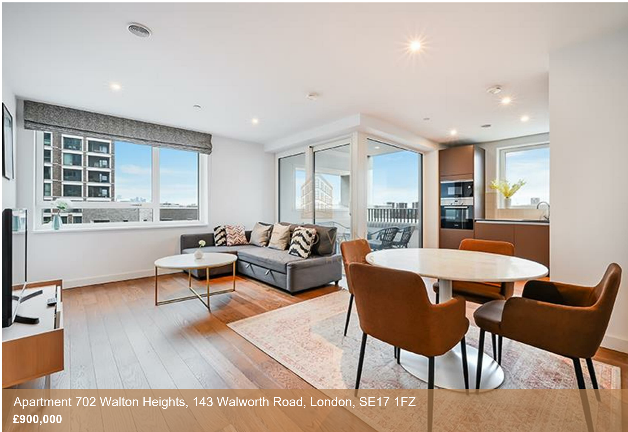
Apartment 702 Walton Heights, 143 Walworth Road, London, SE17 1FZ £900,000