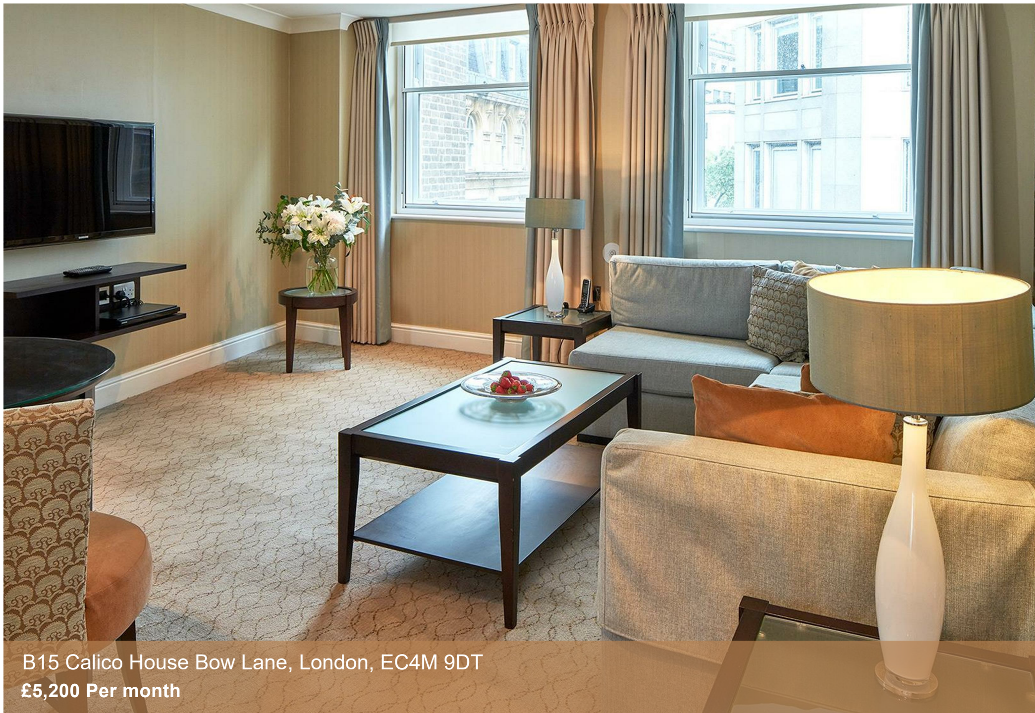
B15 Calico House Bow Lane, London, EC4M 9DT £5,200 Per month