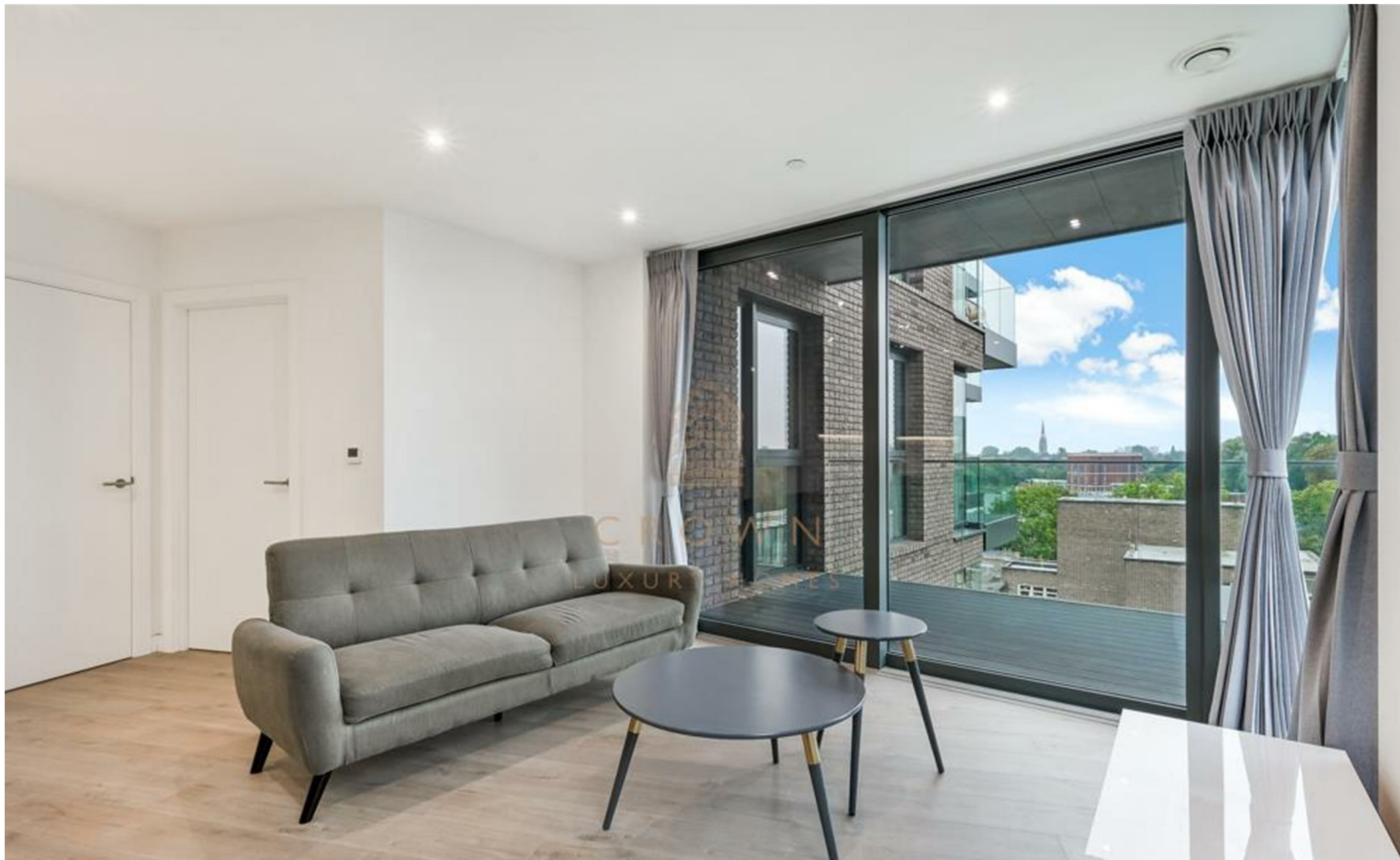
Flat 201, Willowbrook House Coster Avenue, Hackney, N4 2ZB £2,500 Per month