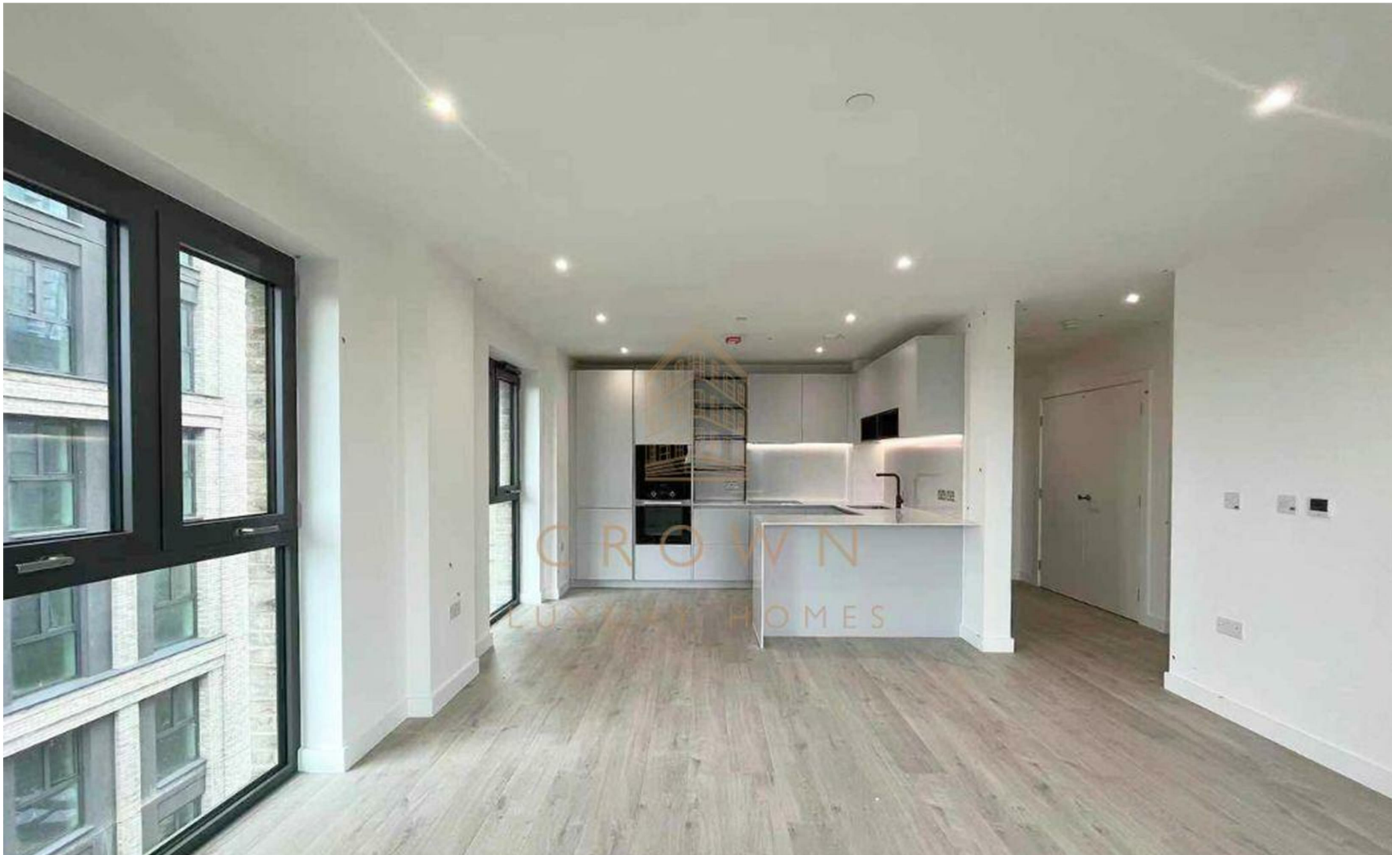
51 Darter House Anax Street, London, N4 2UE £3,500