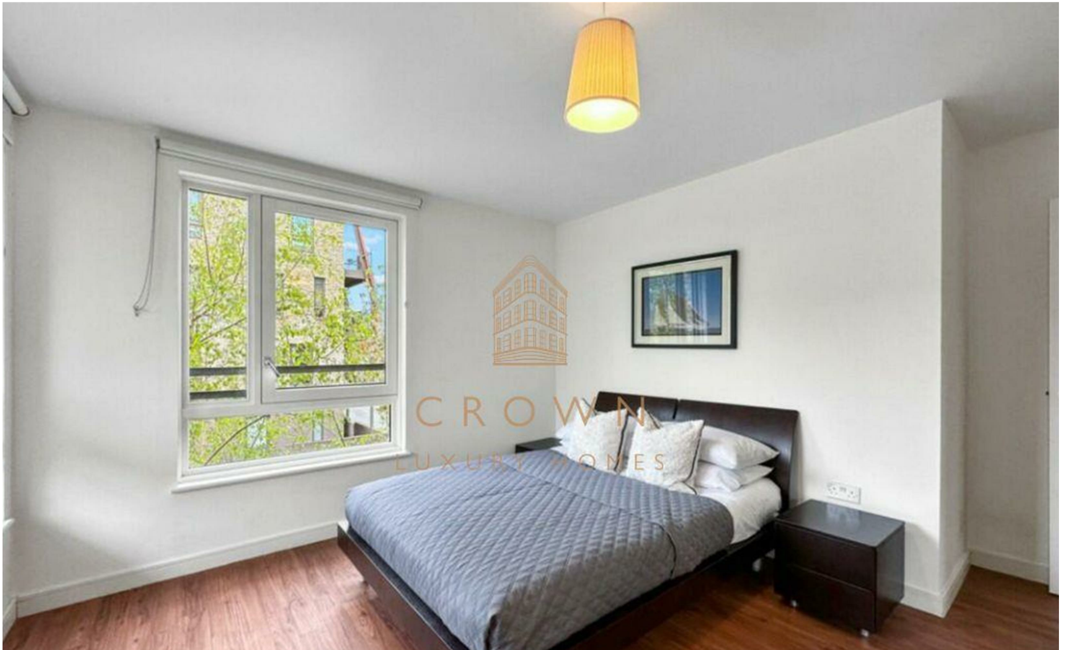
Flat 9s, Campion House 6 Blondin Way, London, SE16 6BA £3,000