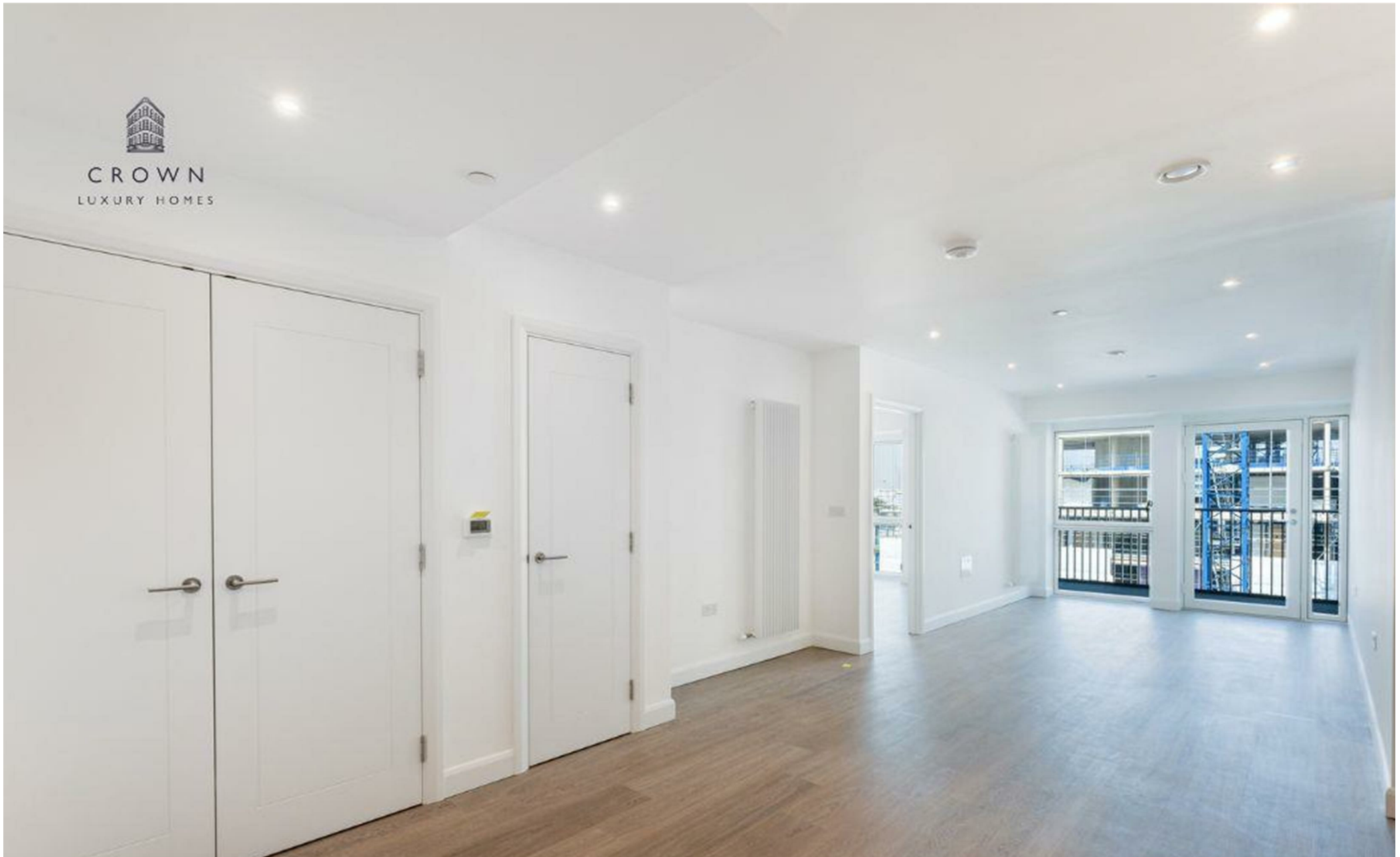
Apartment 1401 Galleria House 12B Western Gateway, Canning Town, London, E16 1DA £2,250