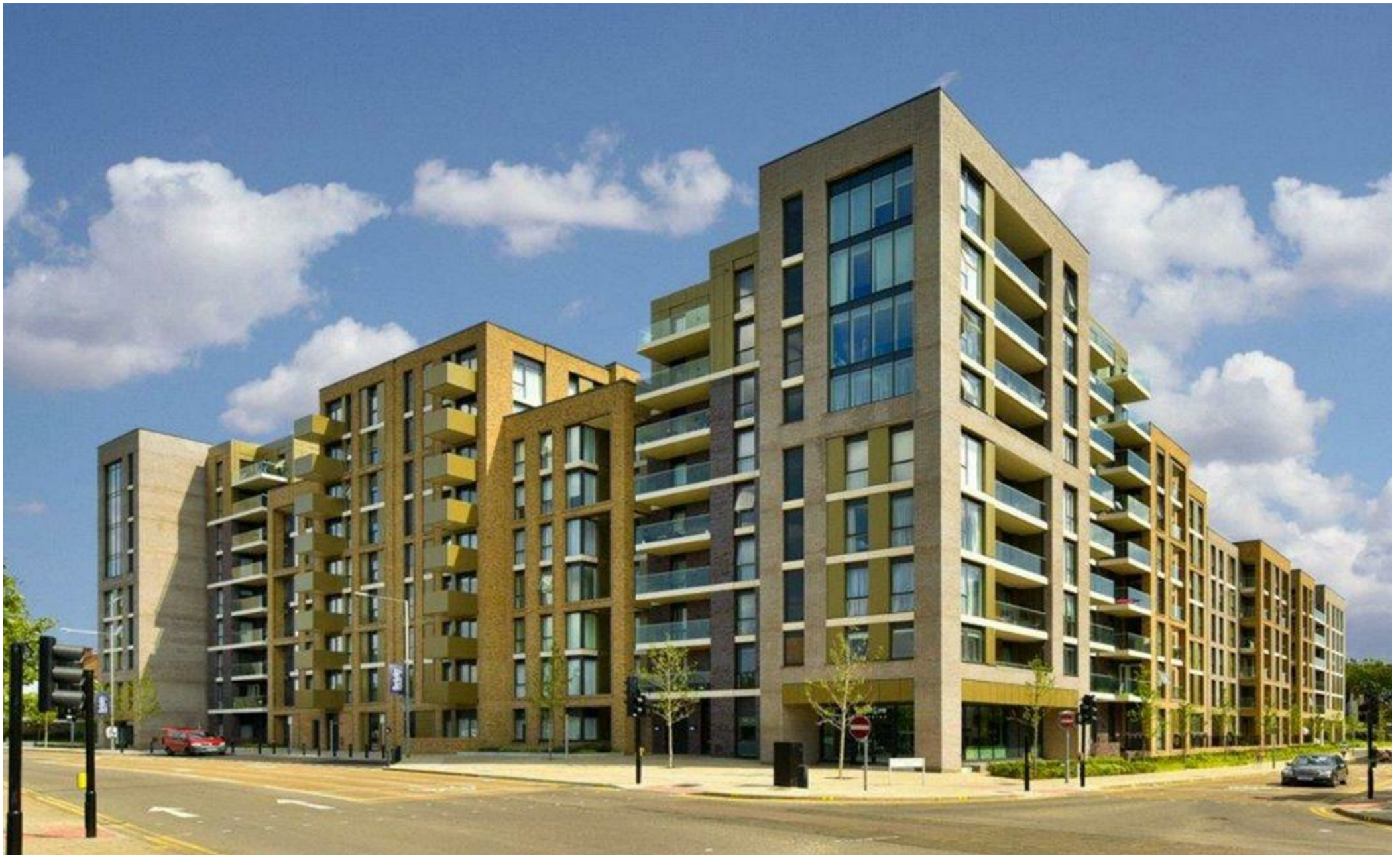
Flat 94, Hamond Court Queenshurst Square, Kingston Upon Thames, KT2 5FW £2,000