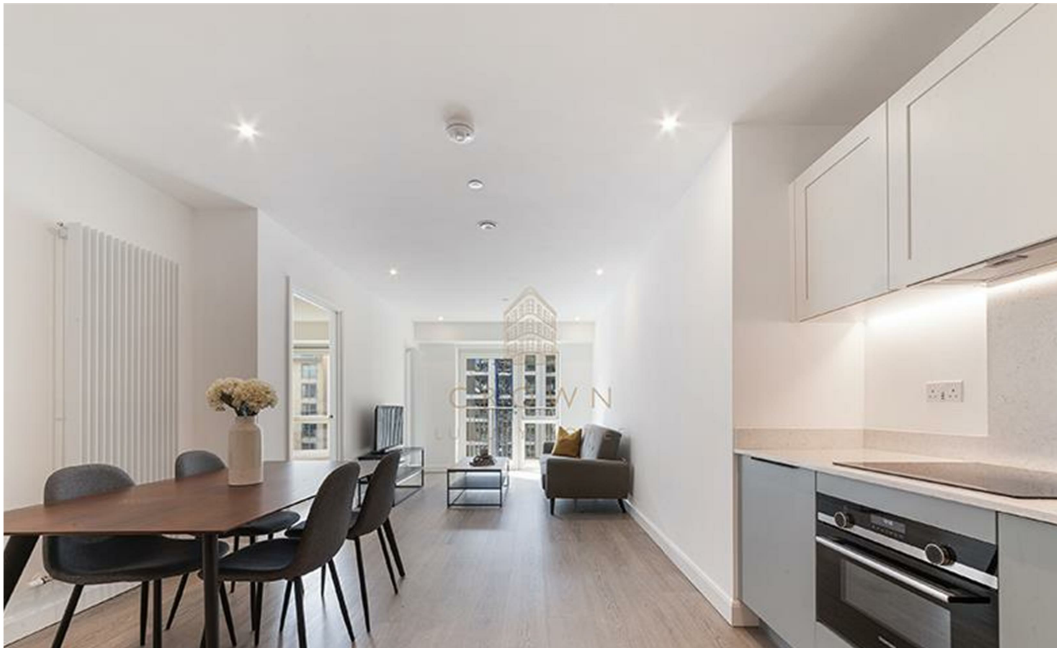
1001 Galleria House 12b Western Gateway, London, E16 1DA £2,175 Per month