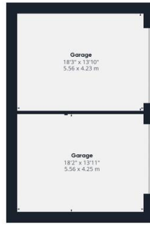
First Floor Building 2