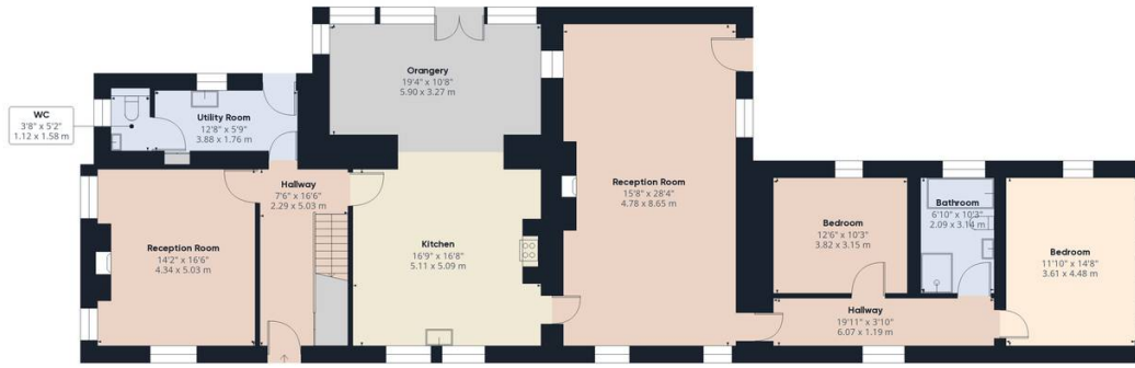
First Floor Building 1

Approximate total area (1) 3144.56 ft 2 292.14 m 2