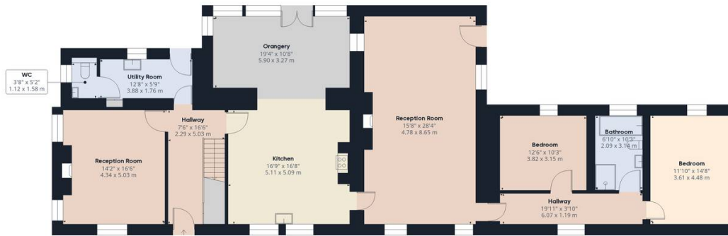
First Floor Building 1

Approximate total area (1) 1855.37 ft 2 172.37 m 2