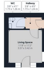
First Floor Building 3