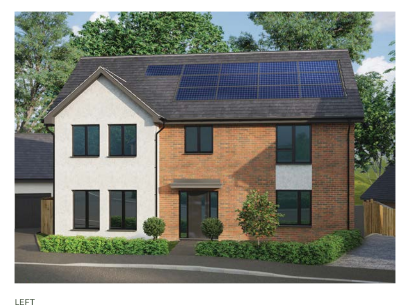
CGI of Langport house type ABOVE CGI of Wellington house type