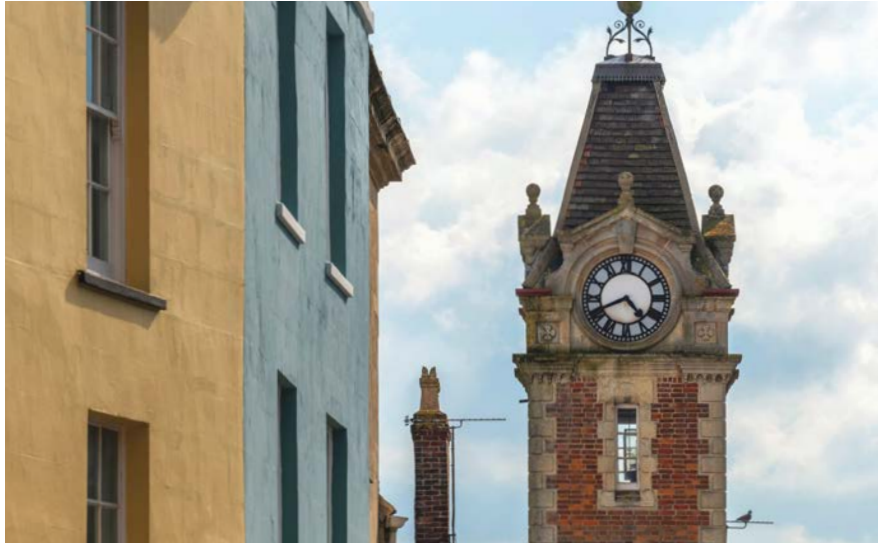
View of Parrock Hill and Cadbury Castle hillfort & clock tower of Wincanton Town Hall

Fresh air and far-reaching views are easily found in this spectacular area of the South West. The ancient hillfort of Cadbury Castle, a short drive from Wincanton, is a particular highlight for escaping into nature.