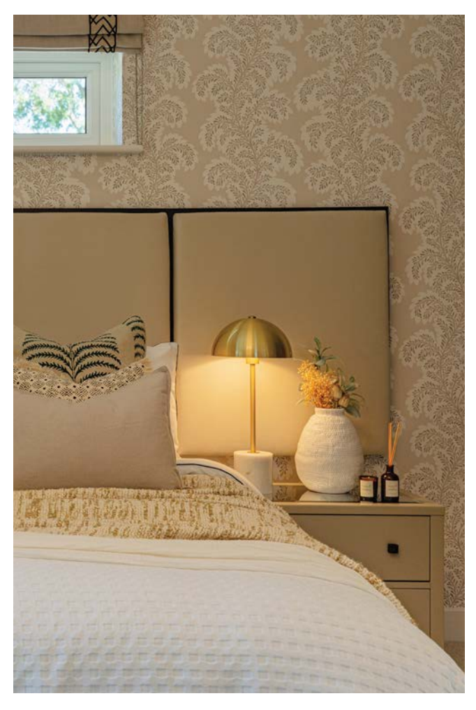
ABOVE & RIGHT Wincanton show home interior