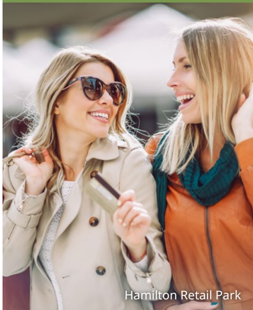
Hamilton Retail Park