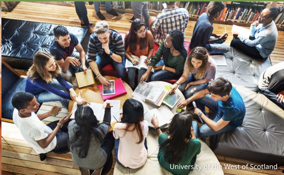
University of the West of Scotland